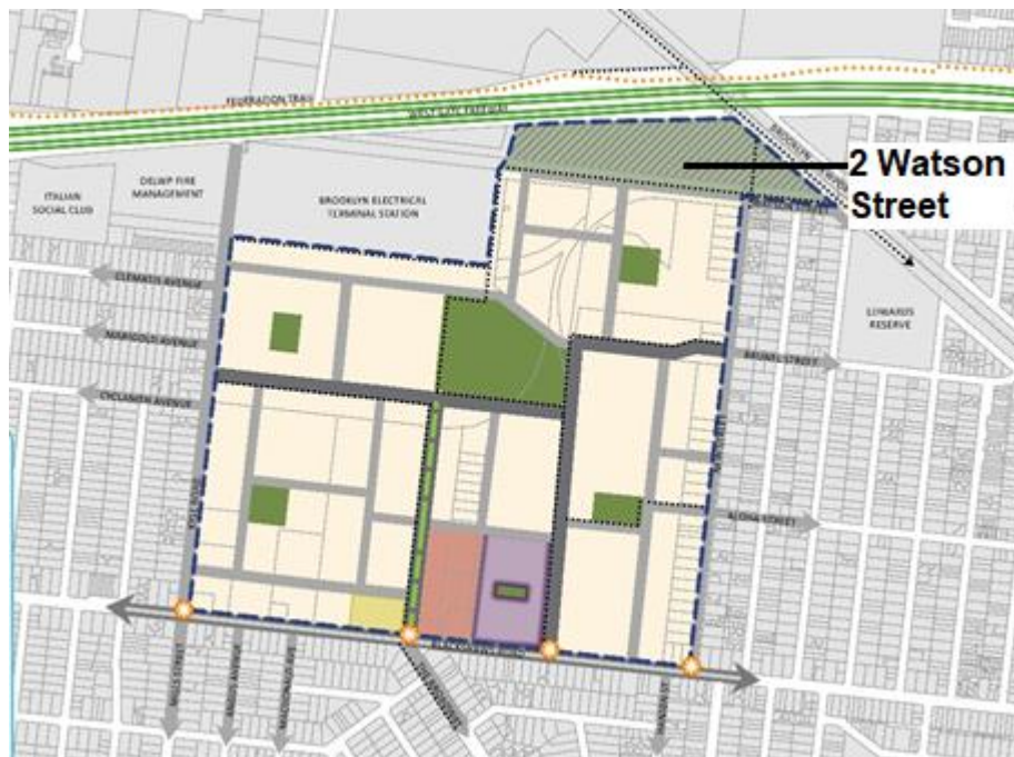
Map Two: 2 Watson Street – Land Required for West Gate Tunnel Project

The proposed acquisition of 2 Watson Street had implications on Amendment C88 particularly calculations contained within the DCP, DCPO and the open space requirements of Clause 52.01. It was considered that 2 Watson Street, should be retained as part of Amendment C88 in the event that the WGTP did not proceed and as a result the documents and figures were updated accordingly.