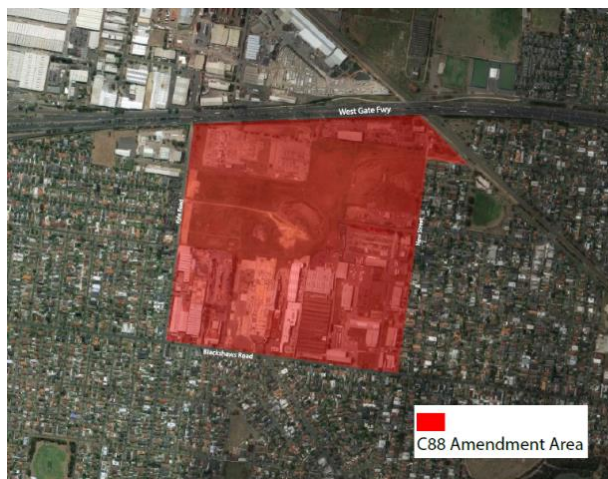
Map One: Precinct 15 - Amendment C88 Area

Precinct 15 is a complex site with a number of planning and land use challenges. Fragmented land ownership, potential contamination, management of dwelling yields, a constrained transport and movement network, external and internal interface issues such as noise and vibration, the provision and delivery of services such as community facilities and management of infrastructure provisions through the development contributions framework are some of these challenges. Notwithstanding, the development of Precinct 15 can achieve a net community benefit and deliver an excellent outcome.