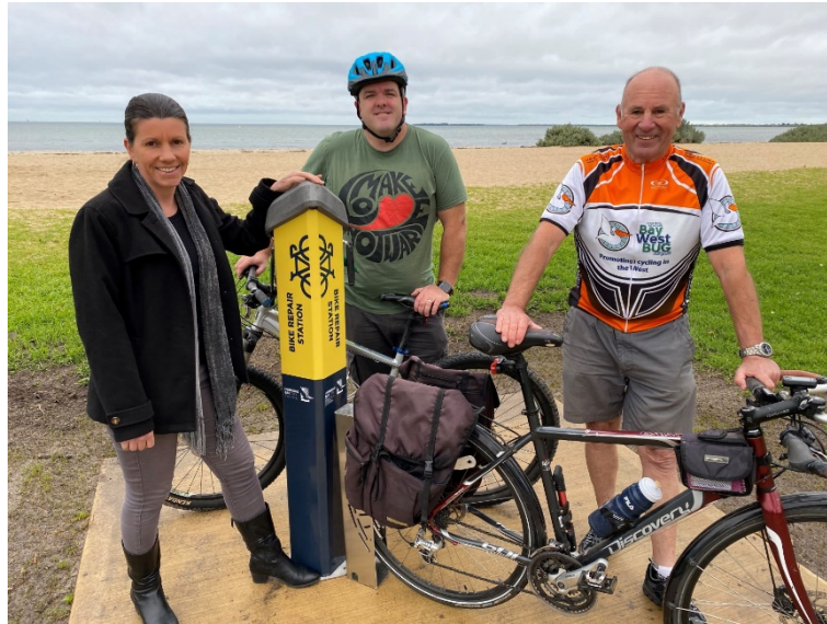
Figure 6: Bike repair stations – promoting the benefits of physical activity

This year's World Environment Day event was held virtually. The theme was "Celebrating Biodiversity". Cr Gates featured in a promotional video about World Environment Day and introduced a full program of online and interactive events. The uploading of a conservation map highlighting features in and around Hobsons Bay which are significant for their natural heritage and biodiversity has been well received and continues to be accessed months after the event. Other activities on the day included workshops by My Smart Garden and the local Urban Harvest program and a promotional video "Conservation Conversation" hosted by Newport resident Doug Palmer.