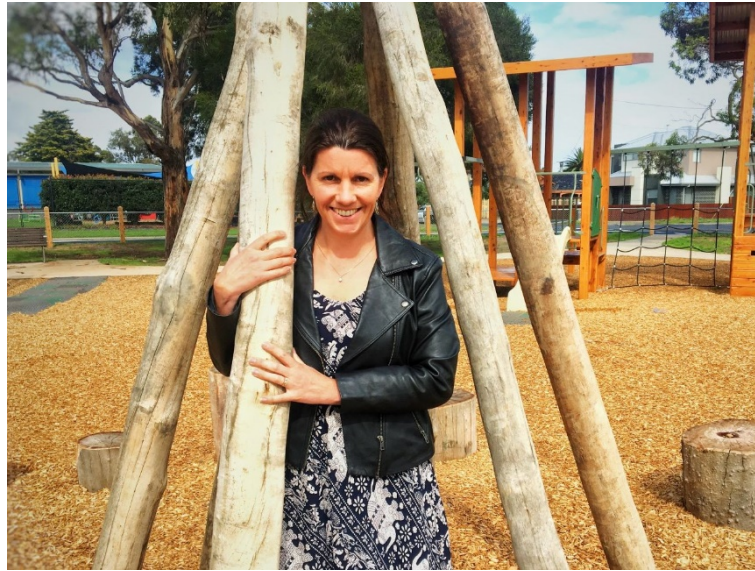
Figure 1: Mayor Cr Colleen Gates at G Den Dulk Reserve, Altona