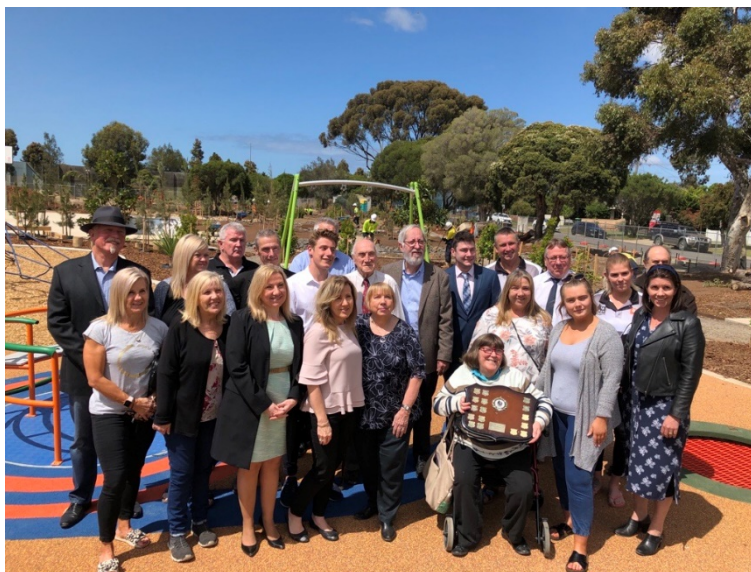
Figure 5: Curlew Community Park

Curlew Community Park has quickly become a valued asset by the community, with positive feedback received and an increasing number of visitors. It provides much-needed green open space, infrastructure and activities for people of all ages and abilities, including families with young children, the elderly and the often-neglected youth age group.