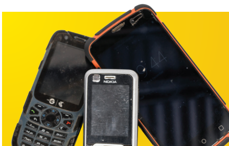
MOBILE PHONES & ACCESSORIES