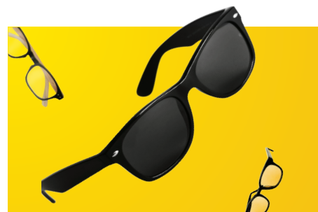
GLASSES (READING & SUNGLASSES)