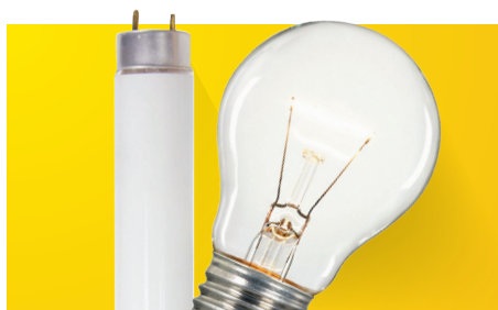
LIGHT GLOBES & TUBES