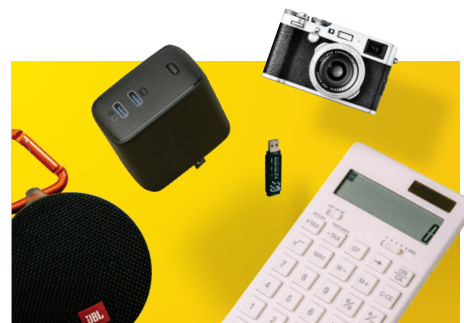
SMALL E-WASTE ITEMS