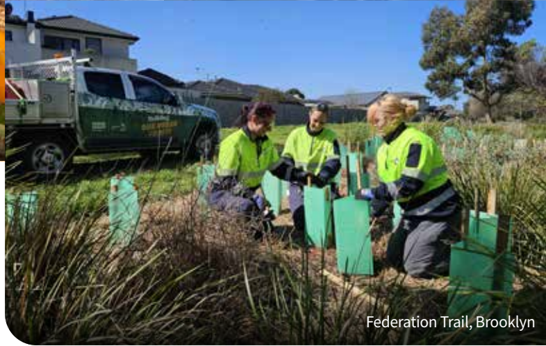
Federation Trail, Brooklyn