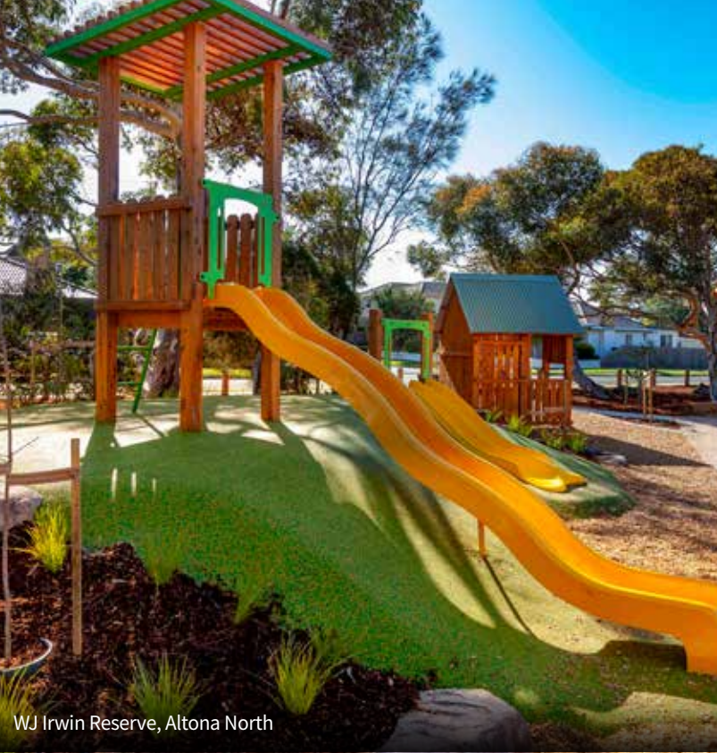
WJ Irwin Reserve, Altona North