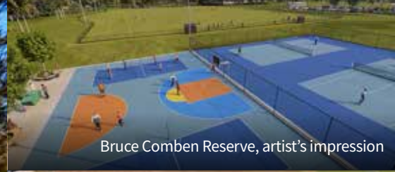
Bruce Comben Reserve, artist's impression