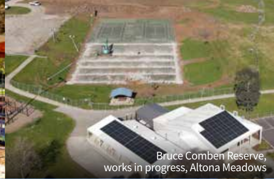
Bruce Comben Reserve, works in progress, Altona Meadows