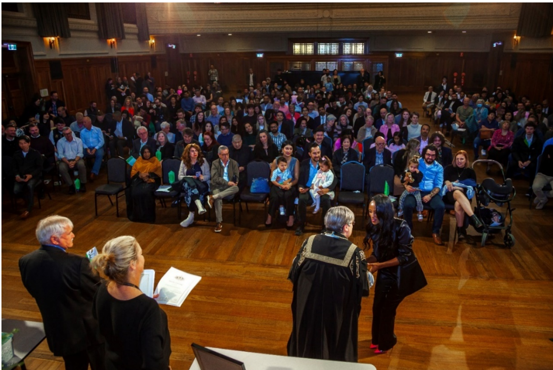
Figure 3: A view of the audience at a citizenship ceremony