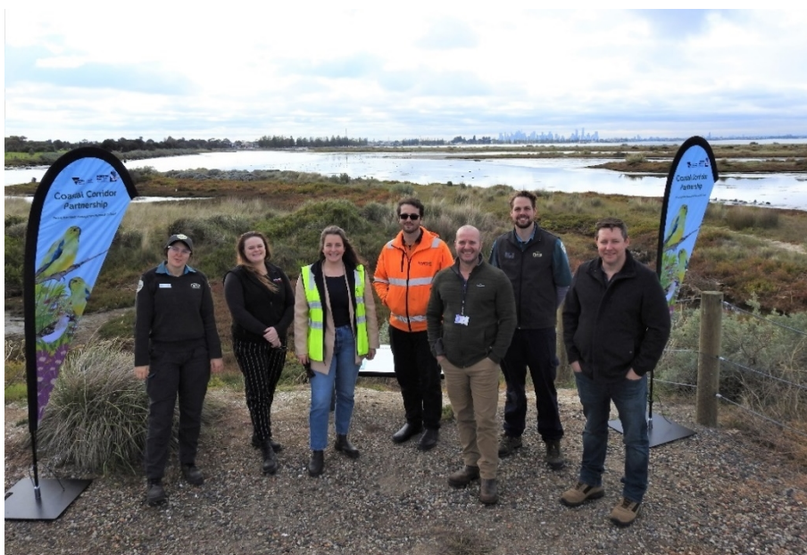
Figure 19: Coastal Corridors Partnership project partners at Laverton Creek estuary (Council, Parks Victoria and Bunurong Land Council)