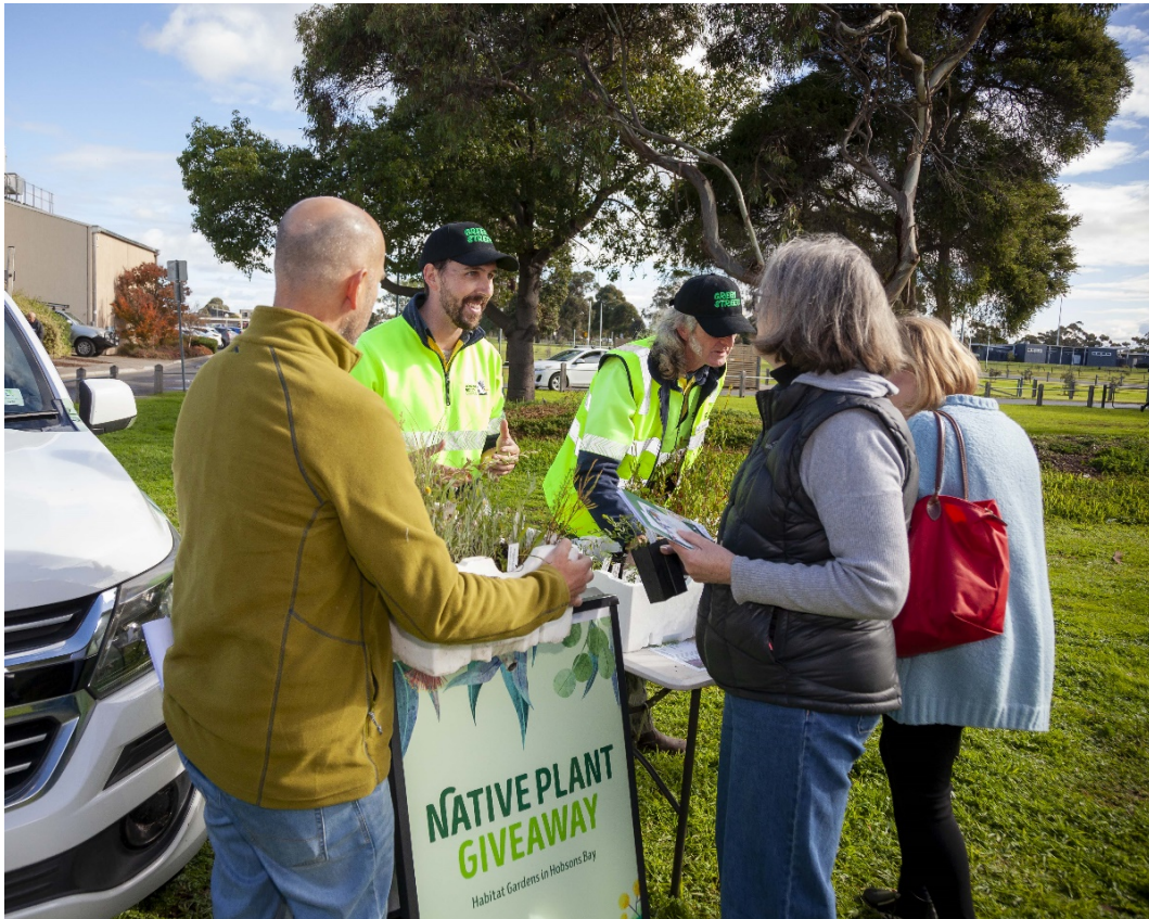
Figures 22 and 23: Native plant giveaways