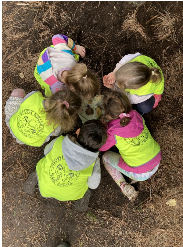
Figure 12: South Kingsville bush kinder