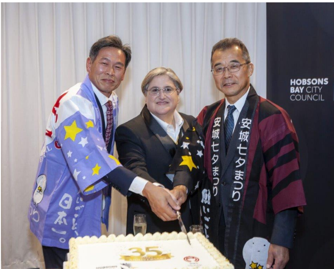
Figure 16: Anjo and Hobsons Bay Mayors cutting cake