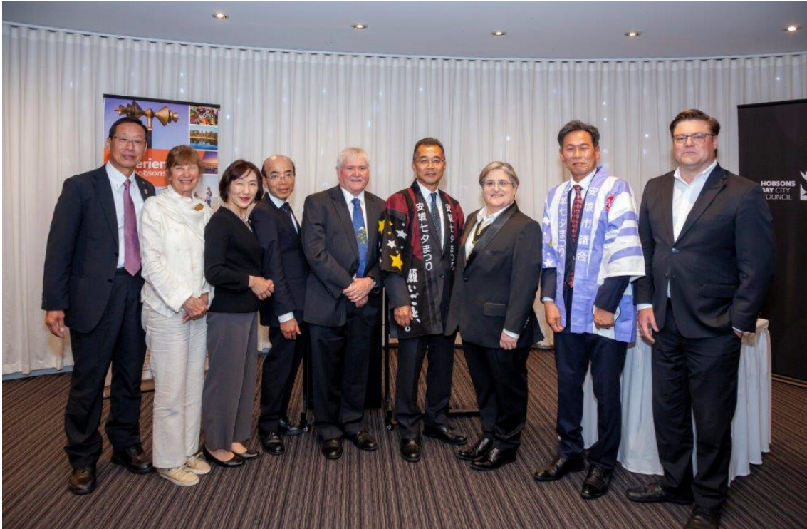
Figure 15: Councillors with Japan Consul-General, Anjo and Hobsons Bay International Friendship Association representatives