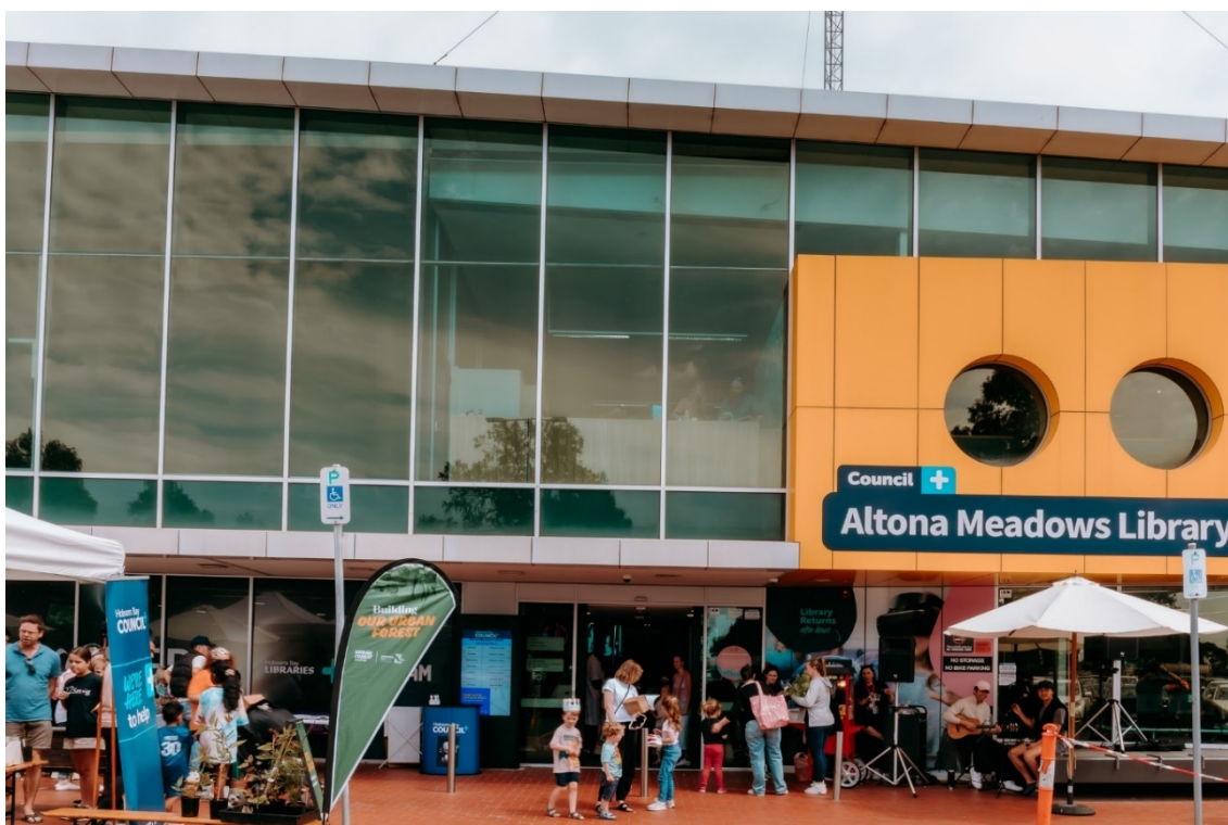
Figure 11: STEAM Centre of Excellence Launch at Altona Meadows Library and Learning Centre