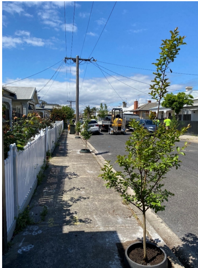
Figure 21: Tree planting in Hotham Street, Williamstown