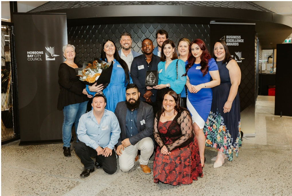
Figure 14: Hobsons Bay Business Excellence Awards – Mayoral Award winners, Assist Ability Australia Victoria