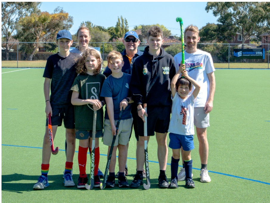
Figure 7: Participants at the Altona Hockey Club Open Day