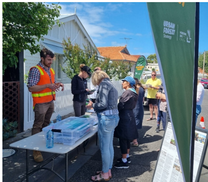
Figure 20: Green Streets consultation at MacLean Street, Williamstown

The Green Streets program was successfully implemented in Fidler Court, Altona Meadows, MacLean Street, Williamstown and Richards Court, Brooklyn. Residents were pleased to see a renewed streetscape that will grow to provide an increased canopy in their street.