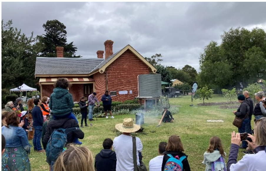
Figure 18: First Nations Smoking ceremony on World Migratory Bird Day

The Conservation Team were also successful in obtaining a grant from the Victorian Government's Port Phillip Bay Fund to engage with the Bunurong Land Council to provide the community cultural engagement sessions in local conservation areas such as Emu-foot Grassland, Truganina Park and Altona Coastal Park. These sessions will aim to increase knowledge of First Nation culture and connect the community with local environments, and will be held during 2024.