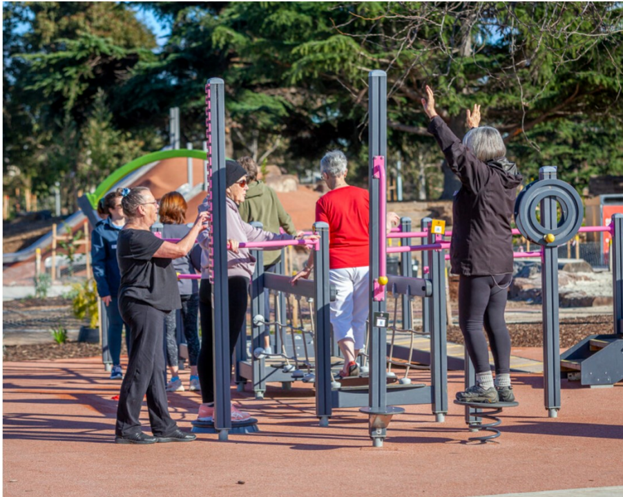
Figure 7: Enjoy Impact seniors exercise group

The Enjoy Impact project is a partnership between Council and the National Ageing Research Institute (NARI) to maximise usage of the recently installed seniors exercise park at Donald McLean Reserve in Spotswood. Council has recruited six volunteer “community champions” who completed training by NARI and are now running sessions at the park to educate community members on its use. Several drop-in sessions were held in October, and this will continue over the coming months. A local advisory group had their first meeting in late October to work together in finding ways to increase community awareness of the park.