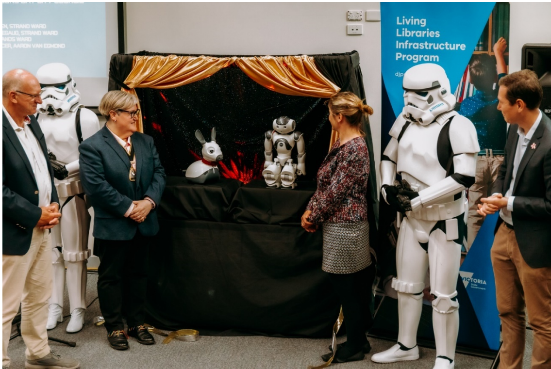
Figure 8: Cr Briffa and others watch a robot puppet show at the STEAM Centre of Excellence launch, with help from some Star Wars stormtroopers. L-R: Warwick Norman AM; Cr Briffa, Cr Grima; Mathew Hilakari MP