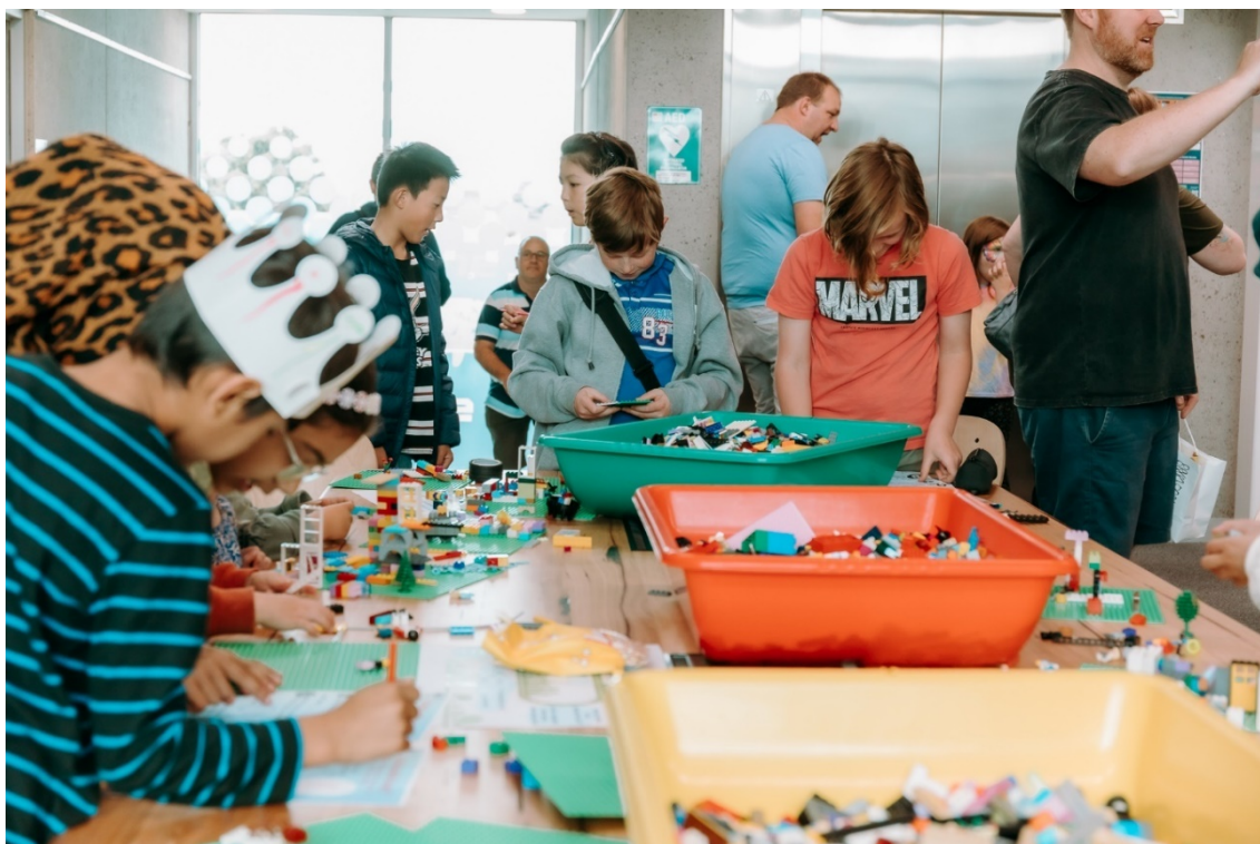
Figure 10: Community members enjoying the Lego table at the STEAM Centre for Excellence launch