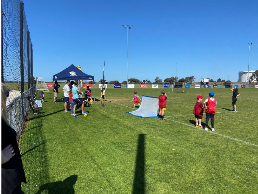
Figure 6: Participants at the Williamstown Soccer Club Open Day

A key priority for Mayor Briffa was the activation of a sports club Community Open Day event, offered to Hobsons Bay clubs on an opt-in basis. Clubs who participated were provided with $200 towards the event and the opportunity to attend a Club Development workshop to help optimise their day. The event was held on 16 September 2023 featuring six clubs across a range of sports and was attended by 110 new participants.