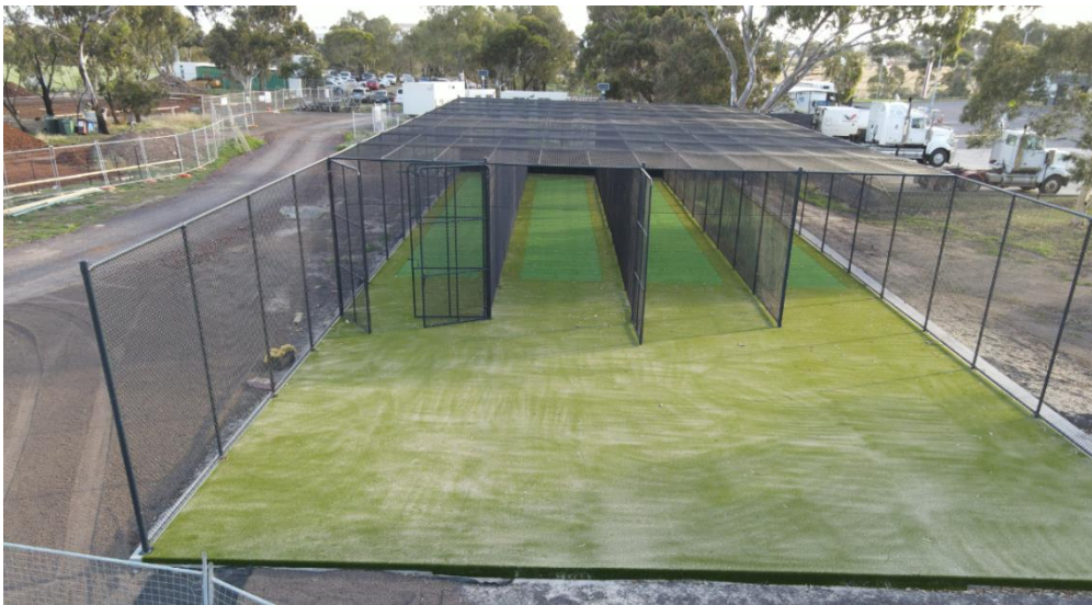
Figure 3: WLJ Crofts Reserve new cricket practice nets

Further details and updates on each of these projects can be accessed via Council's Participate Hobsons Bay website at https://participate.hobsonsbay.vic.gov.au/