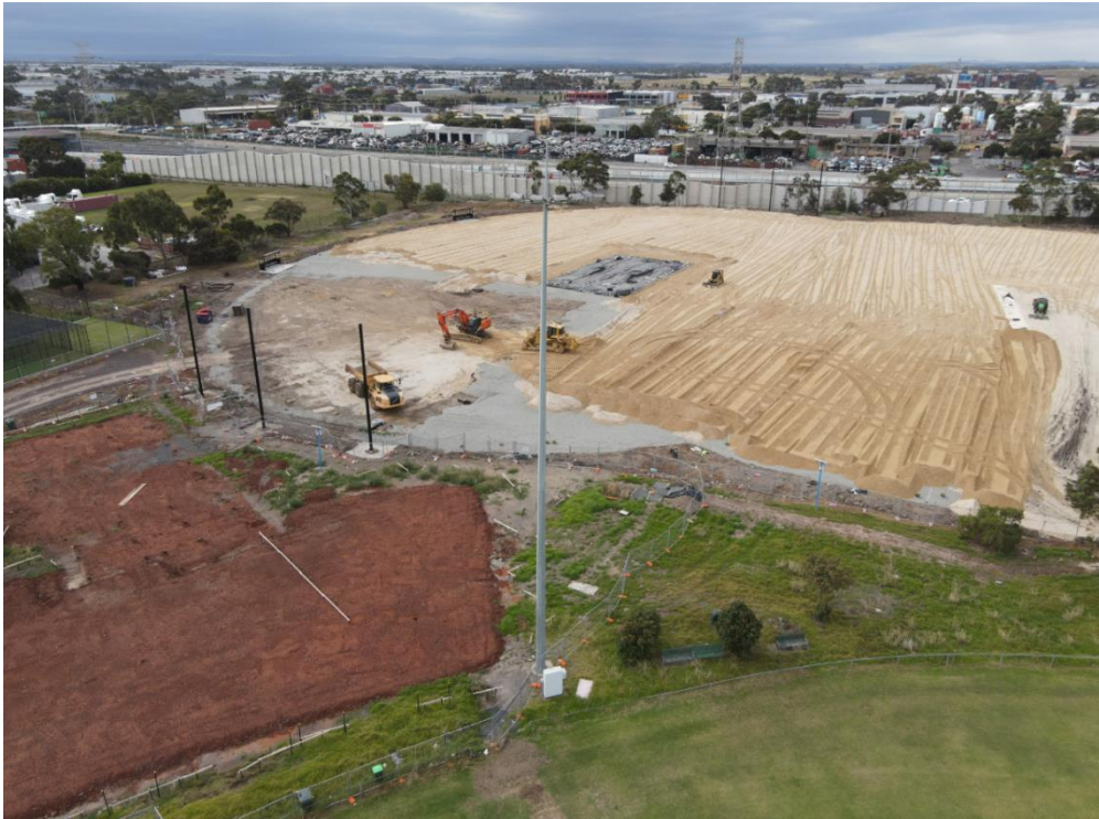
Figure 2: WLJ Crofts Reserve sports ground construction