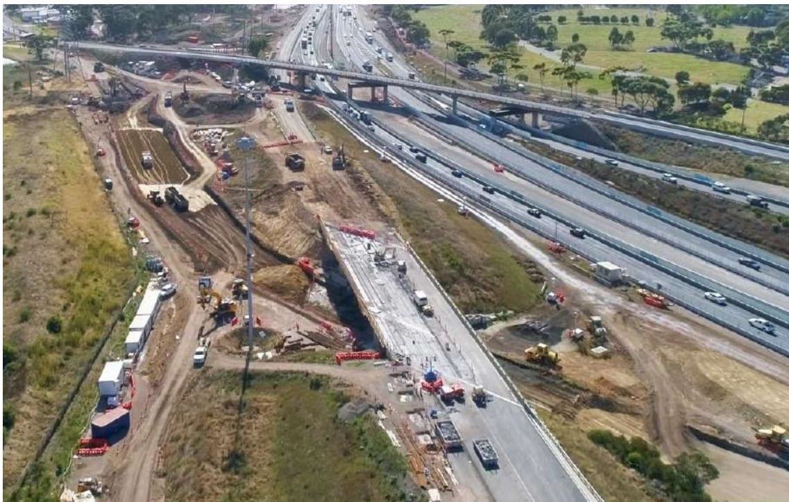
Figure 4: M80 Interchange works

The West Gate Tunnel Project summer works program has seen a lot of construction occurring in the West Zone, with extensive works underway at the Grieve Parade bridge and the M80/Western Ring Road interchange area (Figure 4). Other works progressing include road and bridge widening; noise wall construction; interchange works at Williamstown Road, Millers Road; installation of the pedestrian overpasses; Hyde Street ramps and the southern tunnel portal works.