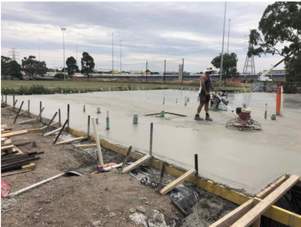
Figure 1: Concrete slab for the new WH Couch Pavilion at Donald McLean Reserve

Works have commenced on the construction of the new sporting club pavilion, WH Couch Pavilion at Donald McLean Reserve, Spotswood. The new cricket practice nets at WLJ Crofts Reserve are complete and the redevelopment of the two northern ovals near completion with the turf laid and irrigation installed. Refer to Figures 1, 2 and 3.