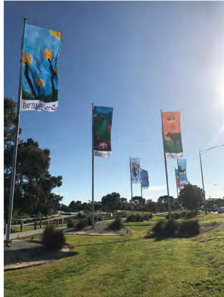
Above: Airtime exhibition space, Altona Meadows Skate Park.