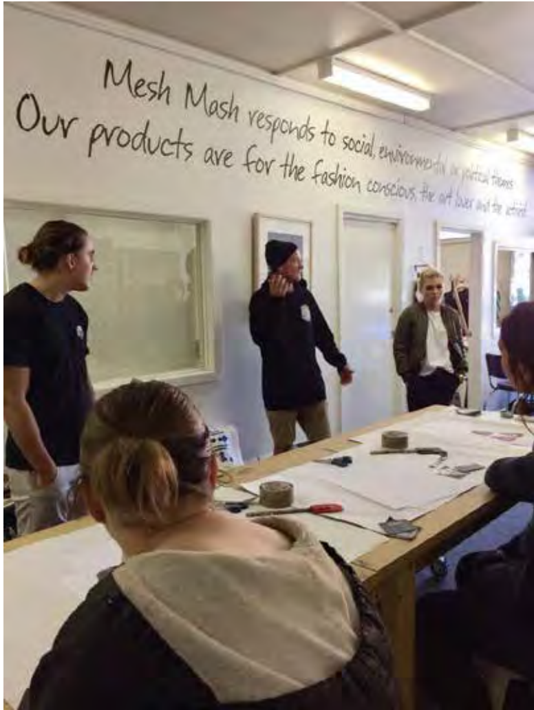
Above: Business/ Creative start up mentoring workshop, Mesh Mash print and design studio. Laverton 2017