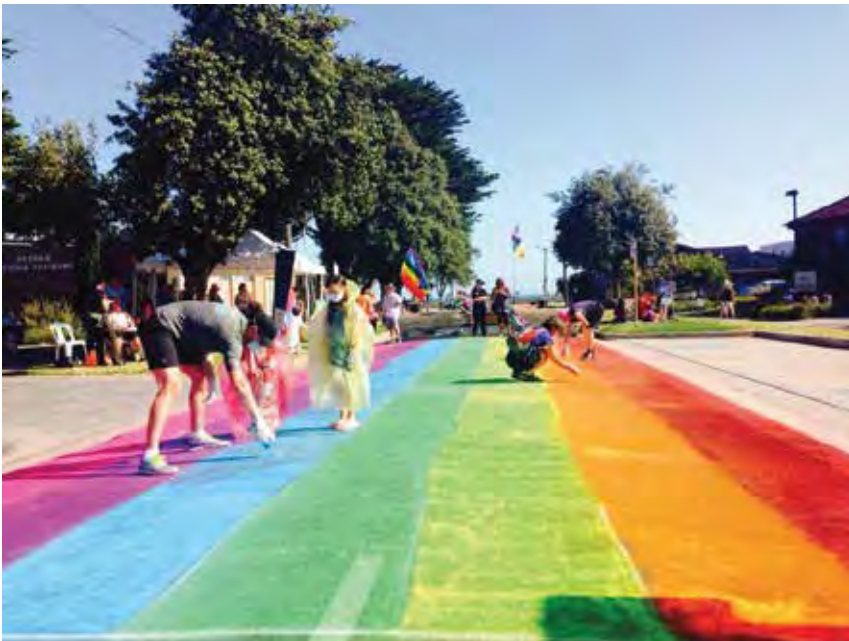
Above: Rainbow Crossing, Sargood Street, Altona Presented as part of GOWEST/ Midsumma Festival 2014