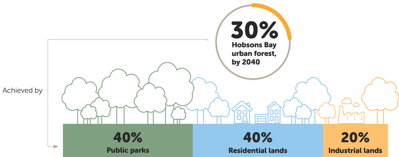
Figure 1.2: Hobsons Bay Urban Canopy Targets

To achieve this assessments will be undertaken to review targets and measure outcomes on a periodic basis.