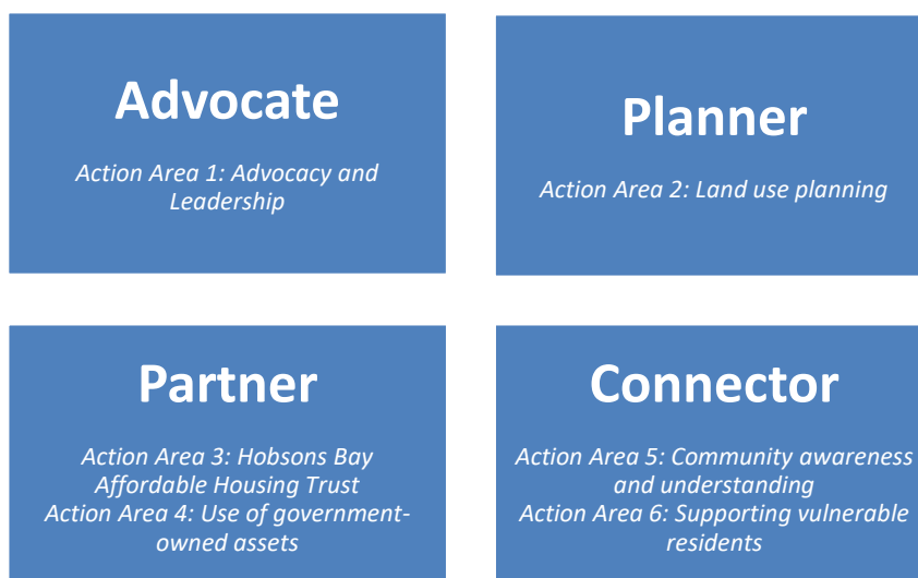
Figure 2: The role of Council in the provision of Affordable Housing

been guided by the Affordable Housing Policy Statement 2016, and complemented by other Council plans, strategies and policies, including the Council Plan 2021-25, Hobsons Bay Housing Strategy 2019, Hobsons Bay Property Strategy 2021 and A Fair Hobsons Bay for All 2019-23.