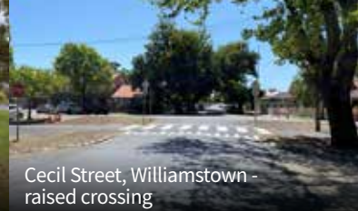
Cecil Street, Williamstown - raised crossing