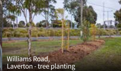
Williams Road, Laverton - tree planting