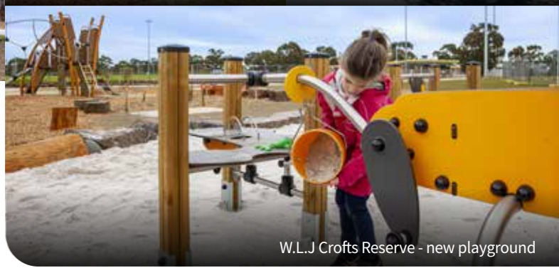
W.L.J Crofts Reserve - new playground