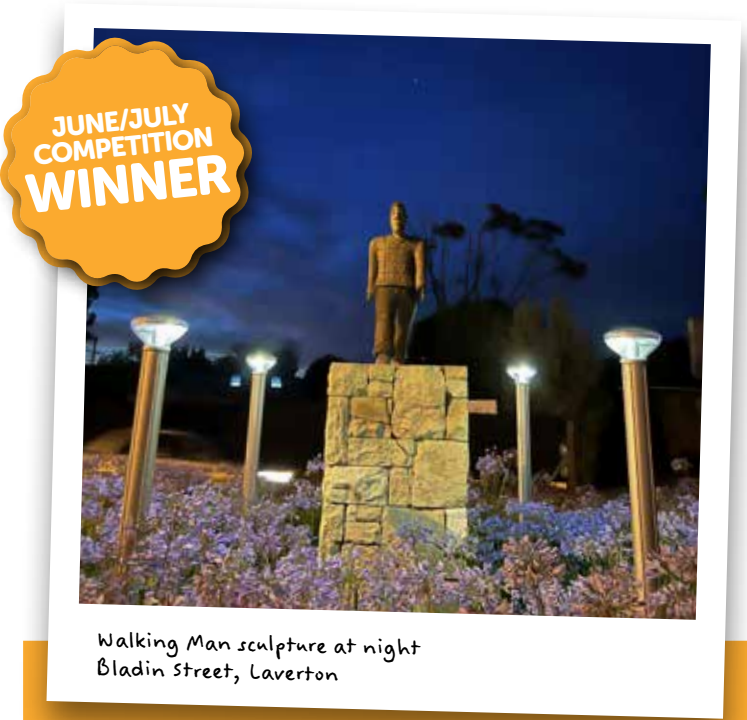
Walking Man sculpture at night Bladin Street, Laverton