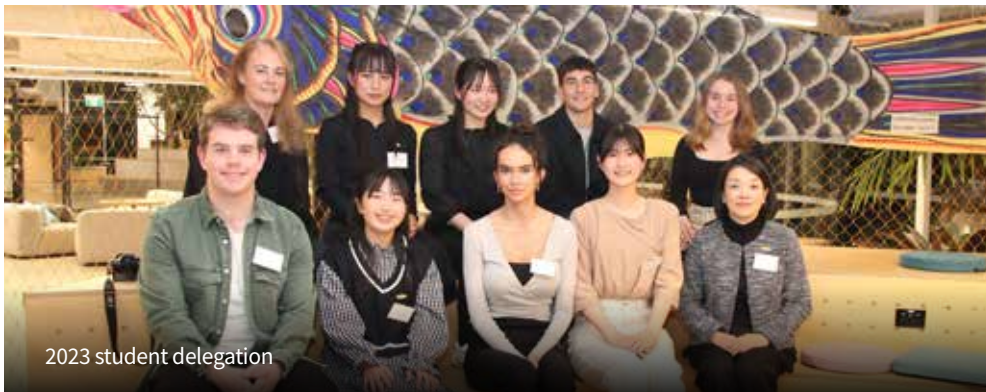
2023 student delegation