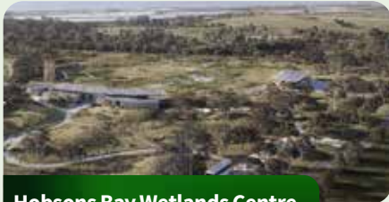
Hobsons Bay Wetlands Centre

For more information about Maternal and Child Health services, including breastfeeding support services and our sleep settling program, please visit www.hobsonsbay.vic.gov.au/MCH