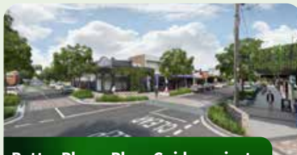
Better Places Place Guide projects

After extensive community consultations through 2020 and 2021, the Better Places program has developed 12 priority projects in the Better Places Laverton Place Guide and 16 priority projects in the Better Places Spotswood and South Kingsville Place Guide. Community consultation is underway for the Brooklyn and Altona North Better Places.