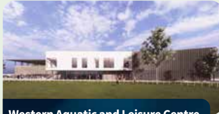
Western Aquatic and Leisure Centre

This ask also includes the reinstatement of a train station in Altona North on the Werribee line to service the increasing population along Blackshaws Road (set to increase due to Precinct 15), employees at the Brooklyn Business Park and residents of the Bradmill site development in neighbouring Yarraville (City of Maribyrnong).