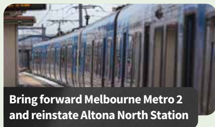
Bring forward Melbourne Metro 2 and reinstate Altona North Station

Council requests the state government brings forward the funding and planning for Melbourne Metro 2 and ensures its completion prior to the building of the outer suburban rail line.