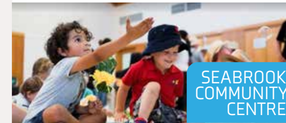
SEABROOK COMMUNITY CENTRE