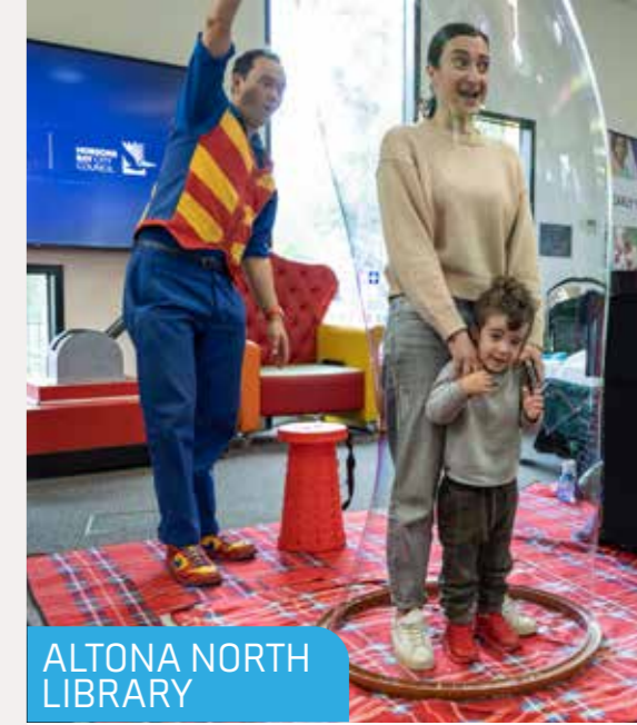
ALTONA NORTH LIBRARY

Now when you visit any Council+ site, you can tend to any council business you may have on top of your usual library services.