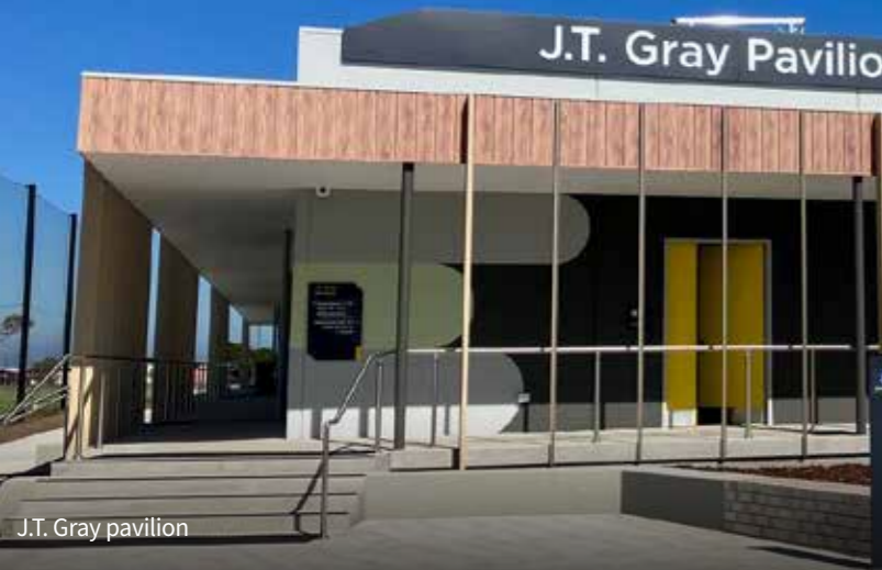
J.T. Gray Pavilion