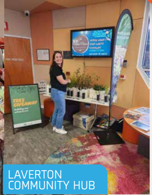
LAVERTON COMMUNITY HUB

COME ALONG TO THE FINAL COUNCIL+ LAUNCH WEDNESDAY 28 JUNE AT NEWPORT COMMUNITY HUB