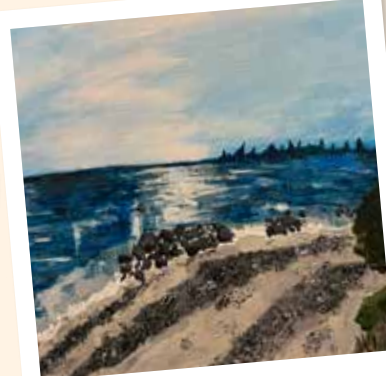
Isabella Under 18 category