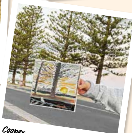
Cooper Under 18 category