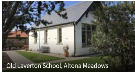
Old Laverton School, Altona Meadows