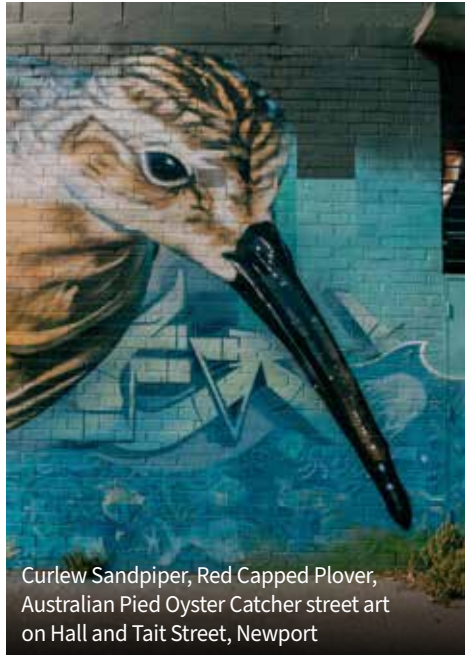
Curlew Sandpiper, Red Capped Plover, Australian Pied Oyster Catcher street art on Hall and Tait Street, Newport