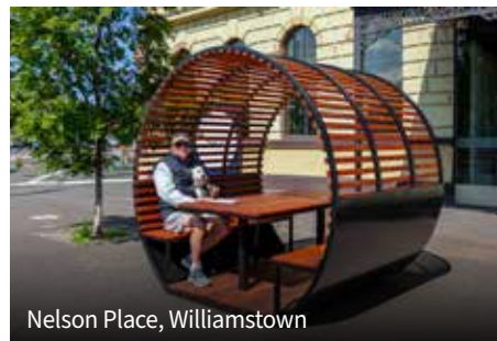
Nelson Place, Williamstown