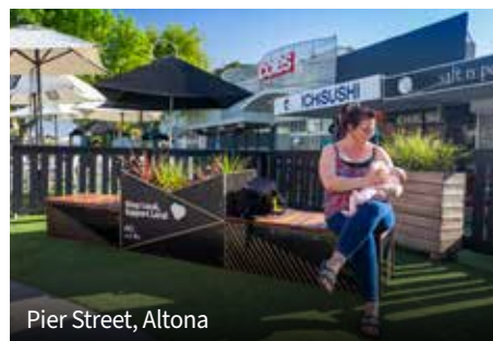
Pier Street, Altona

Next time you're grabbing some takeaway from one of our many great local cafes and restaurants why not have a picnic at one of our new outdoor dining areas.