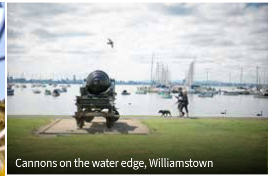
Cannons on the water edge, Williamstown