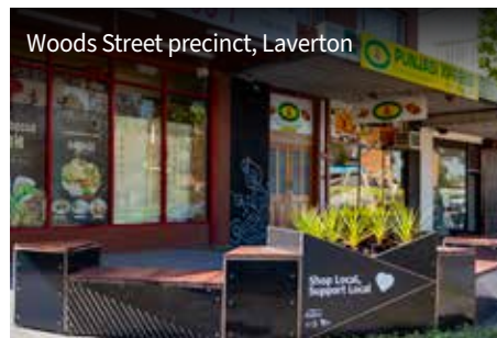
Woods Street precinct, Laverton