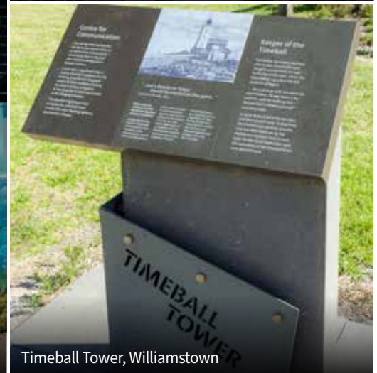
Timeball Tower, Williamstown