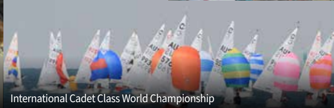
International Cadet Class World Championship