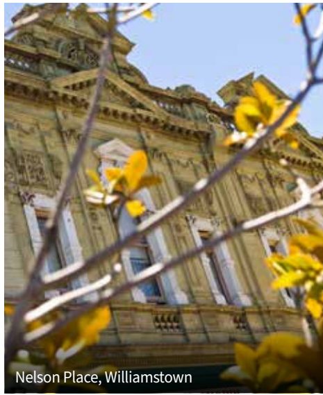
Nelson Place, Williamstown