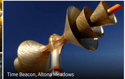
Time Beacon, Altona Meadows