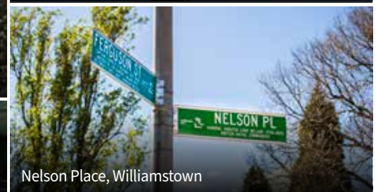
Nelson Place, Williamstown