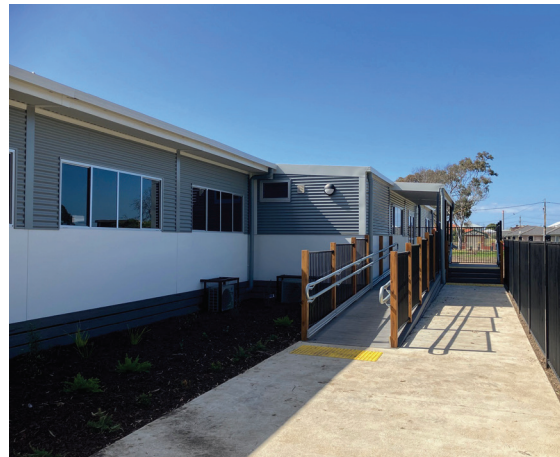
Above: Sutton Avenue Kindergarten