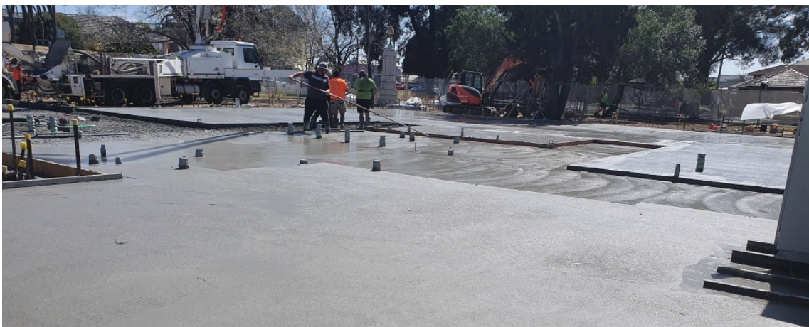
Above: Dennis Reserve

The former Senior Citizens' Centre has been demolished and construction of the new facility has commenced. This includes the installation of the underground services with the pouring of the concrete slab to follow soon. The project is on schedule and due for completion in April 2024.