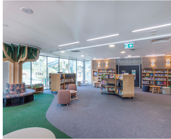
Above: Altona Meadows Excellence Hub