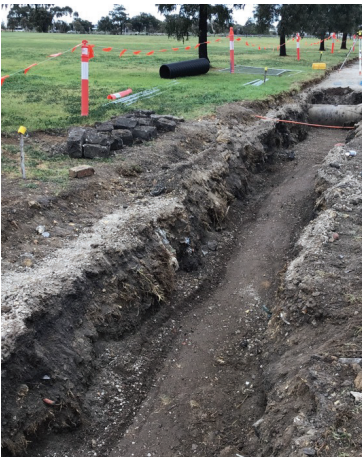
Above: The Strand, Newport - Trenching for drainage installation

Contractors have completed the underground drainage pipe installation works for strand. The next stage is commencement of kerb and channel installation works followed by the reconstruction of the road pavement. This project is expected to be completed by the end of Dec 2023.