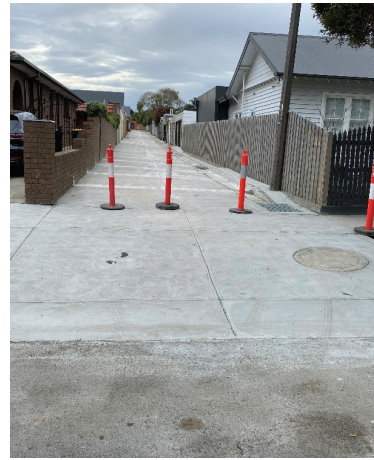
Above: Cunningham Lane Completed ROW