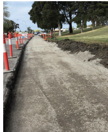
Above: The Strand, Newport - Reinstated surface after the drainage pipe installation