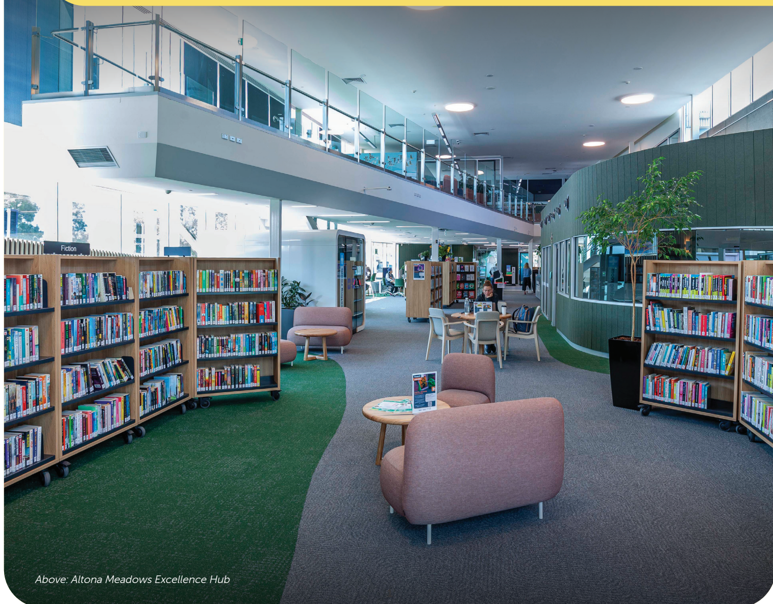
Above: Altona Meadows Excellence Hub