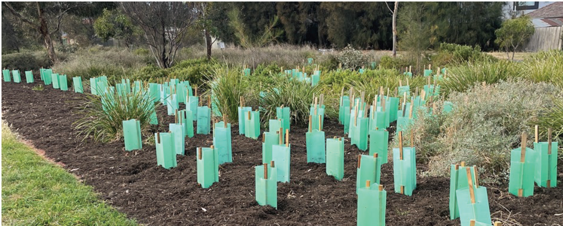
Above: Greening Brooklyn

We've dialled up the greenery along the federation trail in Brooklyn. More than 5000 plants have been planted along the trail in pipeline reserve from Millers Road to Old Geelong Road. Moreover the project will also include improving the reserve entry at both ends with new seating and solar lighting, scheduled to be completed by early 2024.