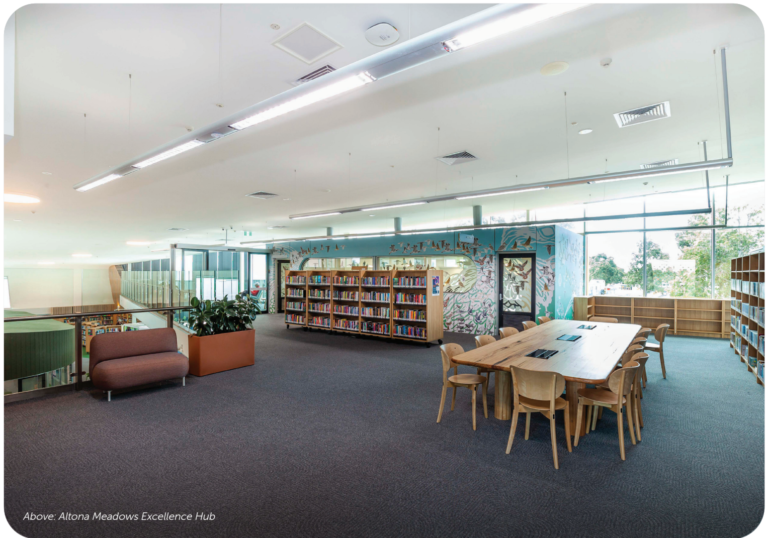
Above: Altona Meadows Excellence Hub