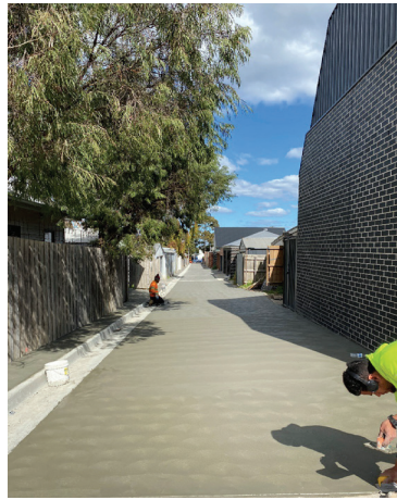
Above: Cunningham Lane placement of concrete pavement