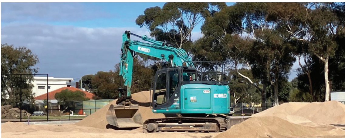
Above: HC Kim Reserve

The existing Kim Reserve pavilion has been demolished. Construction of the new facility has commenced with the installation of underground services. The forthcoming activities include the pouring of the concrete ground floor slab and the erection of the structural steel frame. Works are on track to be completed in July 2024.