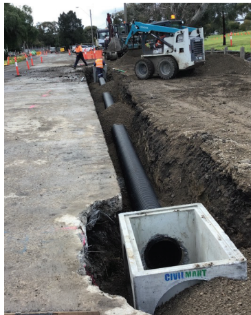
Above: The Strand, Newport - Laying drainage pipes