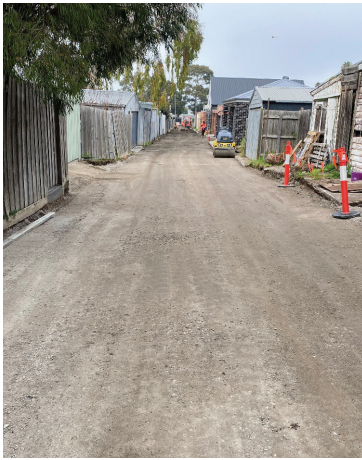
Above: Cunningham Lane Placement of crushed rock

The construction of Cunningham right of way between Newcastle Street and Mason Street Newport has been completed. This involved the construction of a new concrete pavement and installation of drainage to allow better vehicle access and prevent any future flooding to properties. The most challenging part of the project was to match into the different levels of the properties.