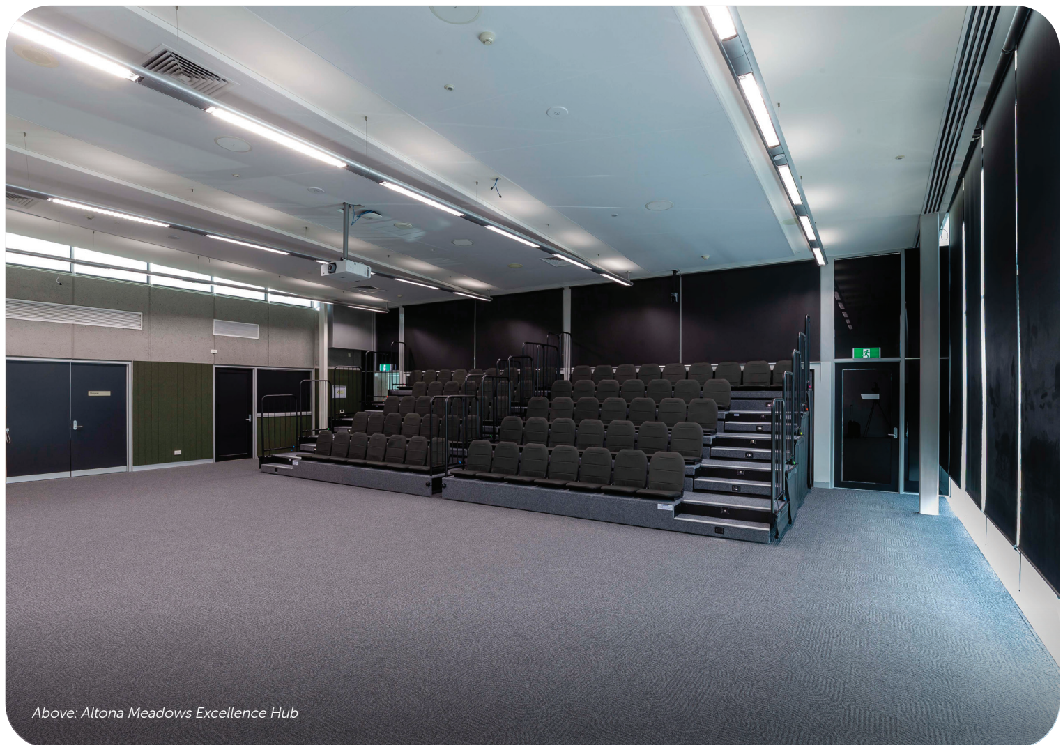
Above: Altona Meadows Excellence Hub