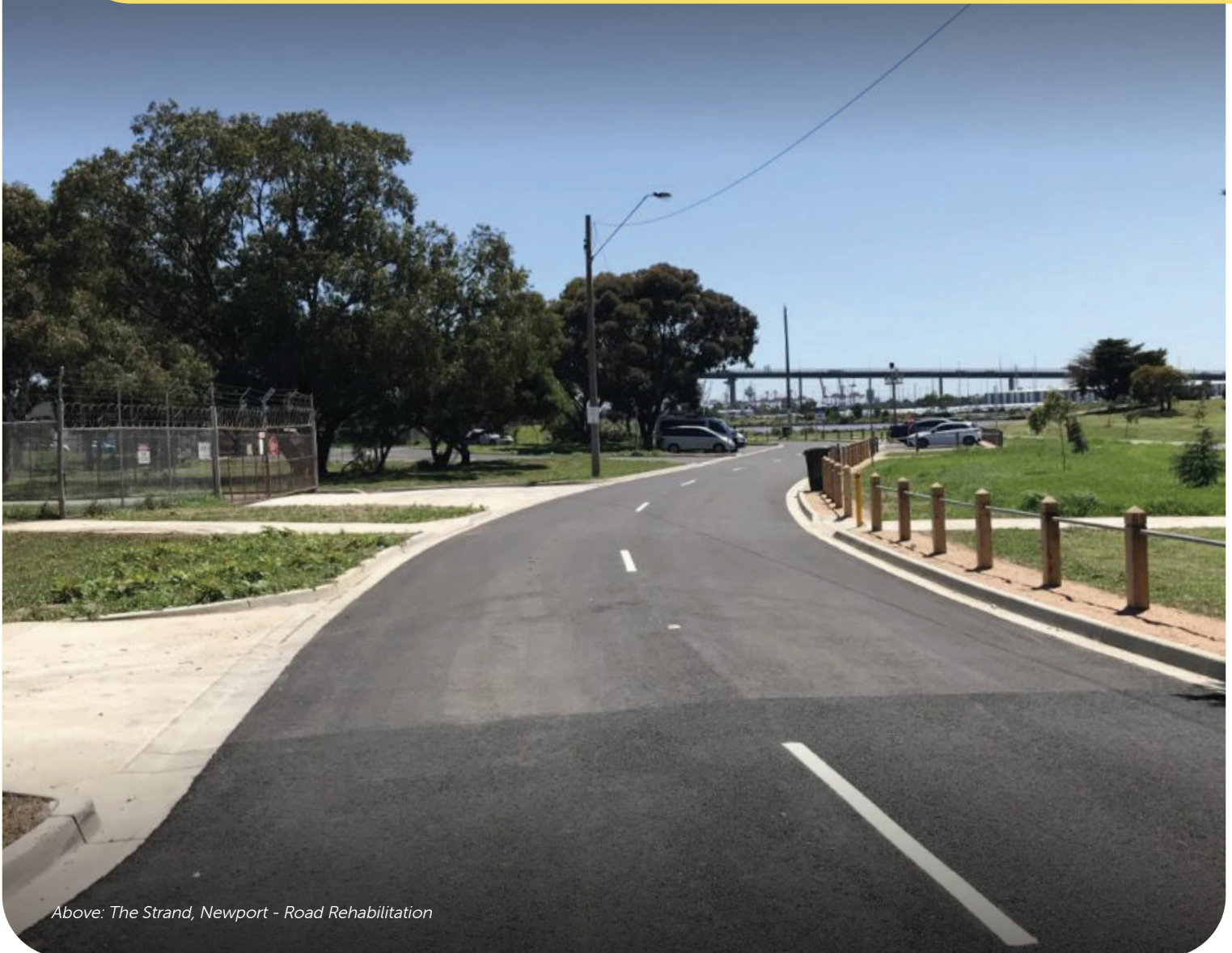
Above: The Strand, Newport - Road Rehabilitation