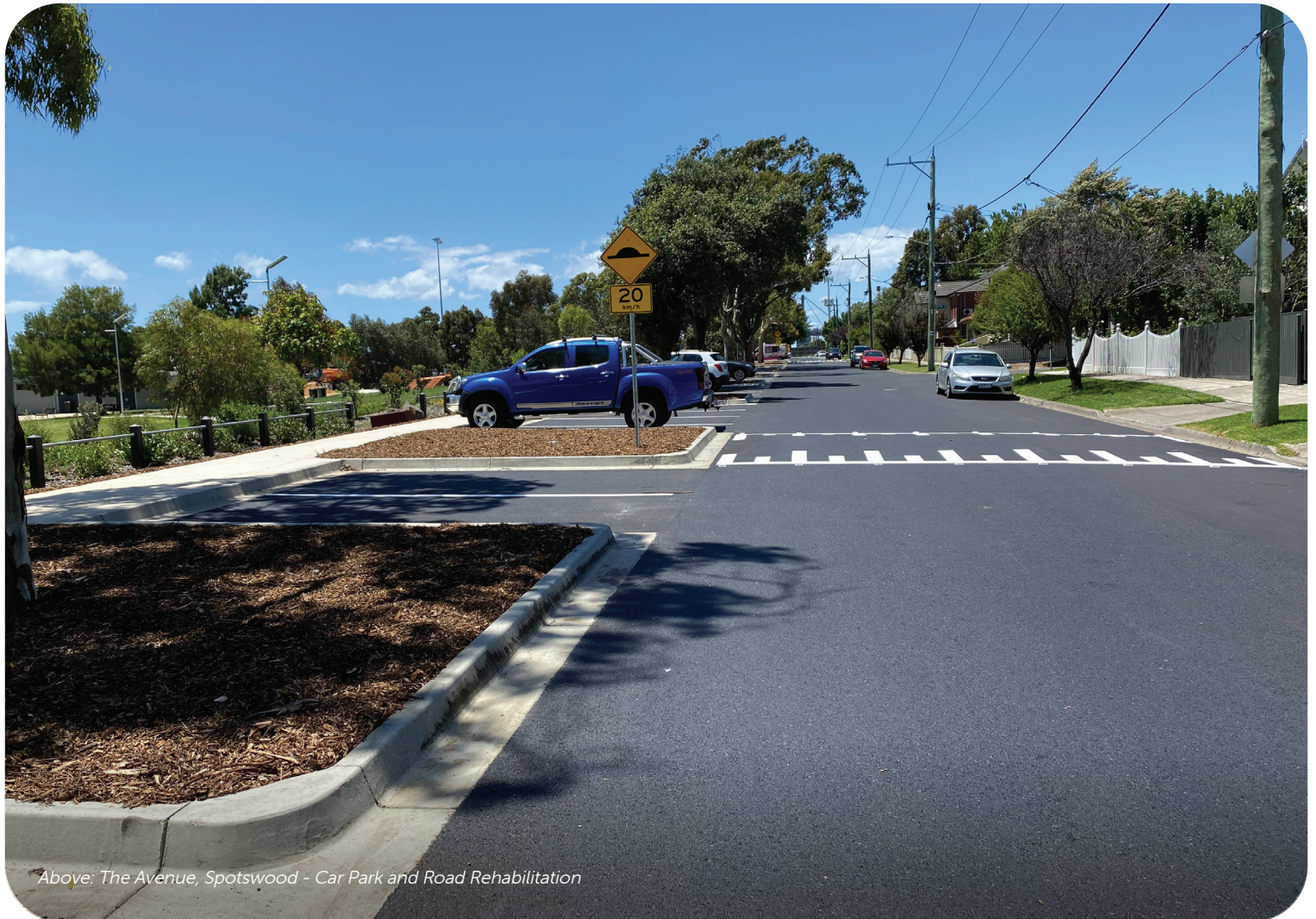
Above: The Avenue, Spotswood - Car Park and Road Rehabilitation