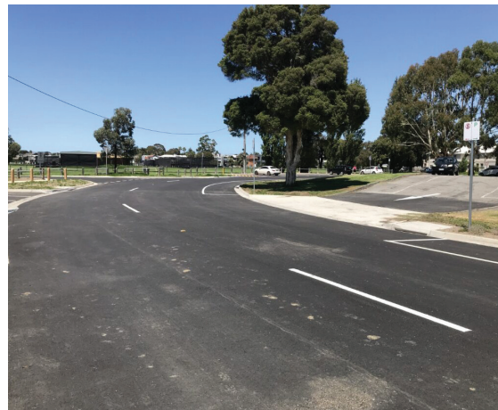
Above: The Strand, Newport – Road Rehabilitation Project