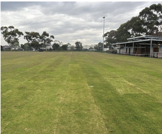
Above: HC Kim Reserve

Pitch 1 has been reconstructed with the turf laid on 6 December 2023. The irrigation has been completed on Pitch 2 and 3 and is now operational. All fencing around the pitches is now erected with the coaches boxes to be installed shortly.