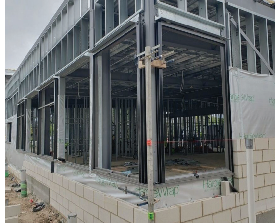
Above: Dennis Reserve