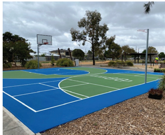
Above: JJ Ginifer Reserve