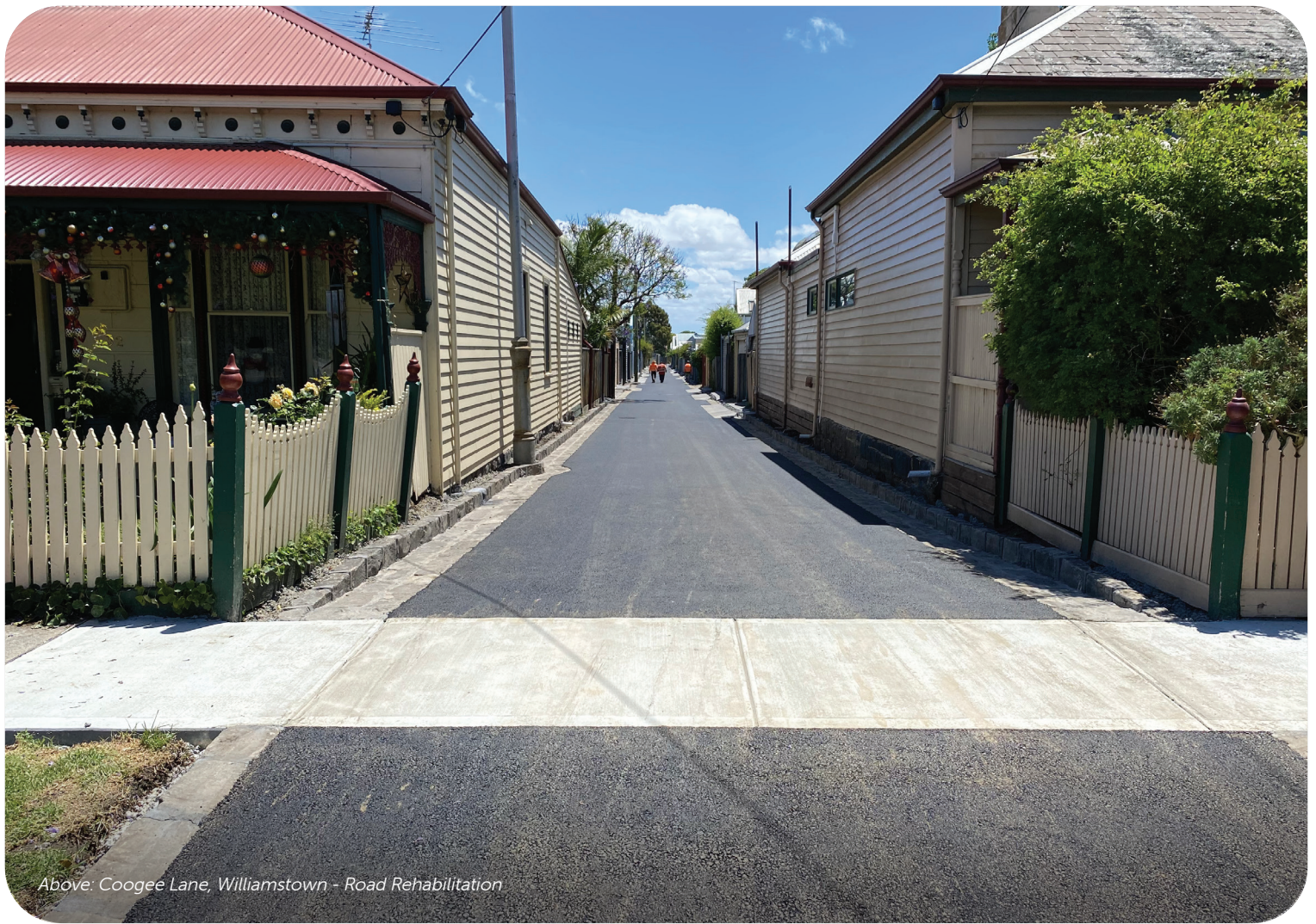
Above: Coogee Lane, Williamstown - Road Rehabilitation