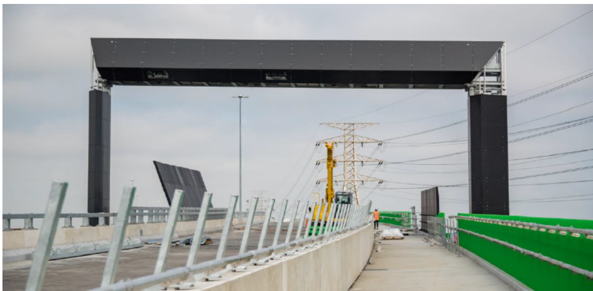
Figure 4: Hyde Street Ramp – Gantry and new Federation Trail installation

The Hyde Street inbound off-ramp has had a new tolling gantry and the green side panels installed (Figure 4), with painting and finishing works undertaken on both the ramps.