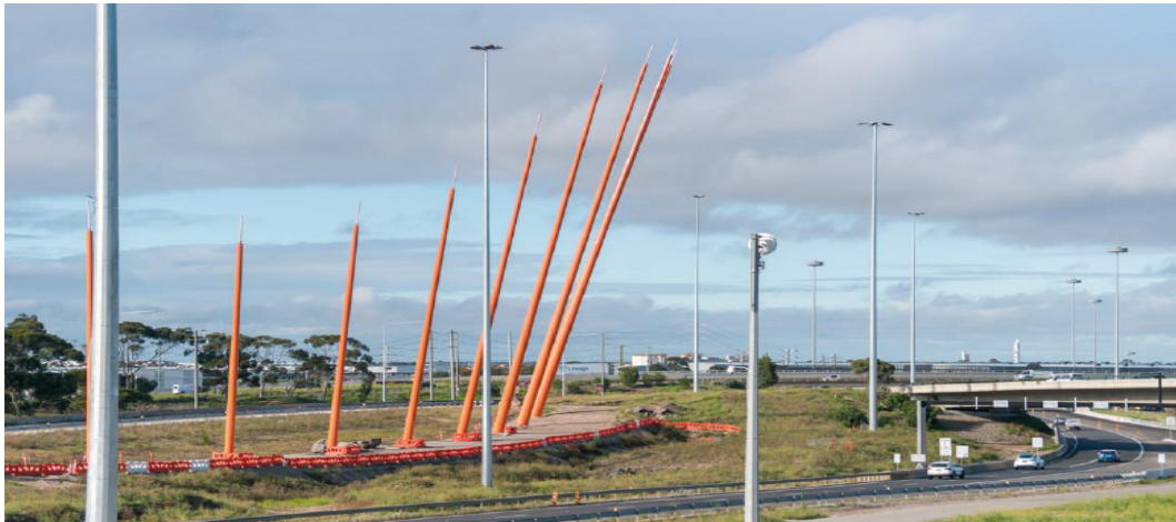
Figure 1: Feature lighting at the M80 interchange

Major works by the JV on widening the West Gate Freeway continued over the past three months, including at the inbound and outbound tunnel portals, the Williamstown Road and M80/Western Ring Road freeway interchange areas, gantry installation, the Hyde Street ramps and the various paths and landscaping. Feature light poles have been installed at the M80 interchange (Figure 1).