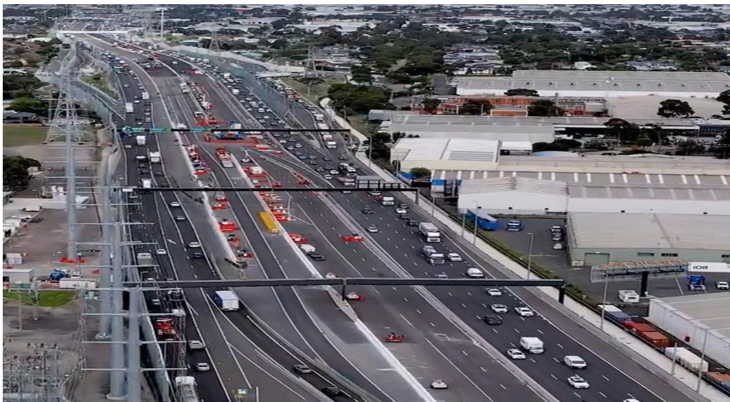
Figure 2: West Gate Freeway West Zone works – outbound

In February, a major lane change has occurred for outbound traffic at the M80 interchange. When using the Princes Freeway to get to Geelong, Werribee or Laverton, outbound traffic needs to stay in the two right lanes to continue on the M1 to the Princes Freeway. Traffic using the M80 Ring Road (Greensborough-bound) to travel towards Ballarat, Deer Park or Caroline Springs, needs to stay in the two left lanes.