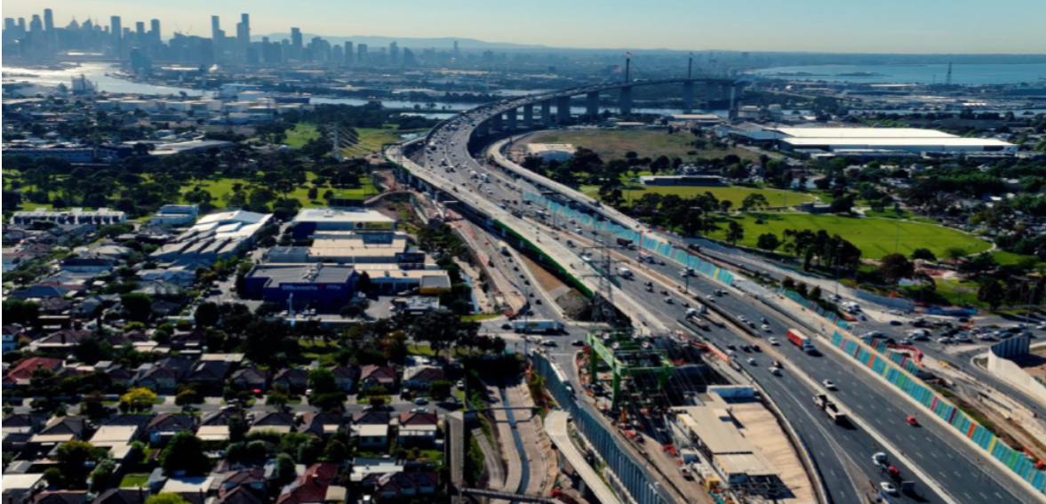
Figure 7: Southern Inbound Portal

Information on tunnel ventilation and air quality, including the latest air quality monitoring report for September 2023 can be found online at: https://bigbuild.vic.gov.au/library/west-gate-tunnel-project/fact-sheets/tunnel-ventilation-and-air-quality