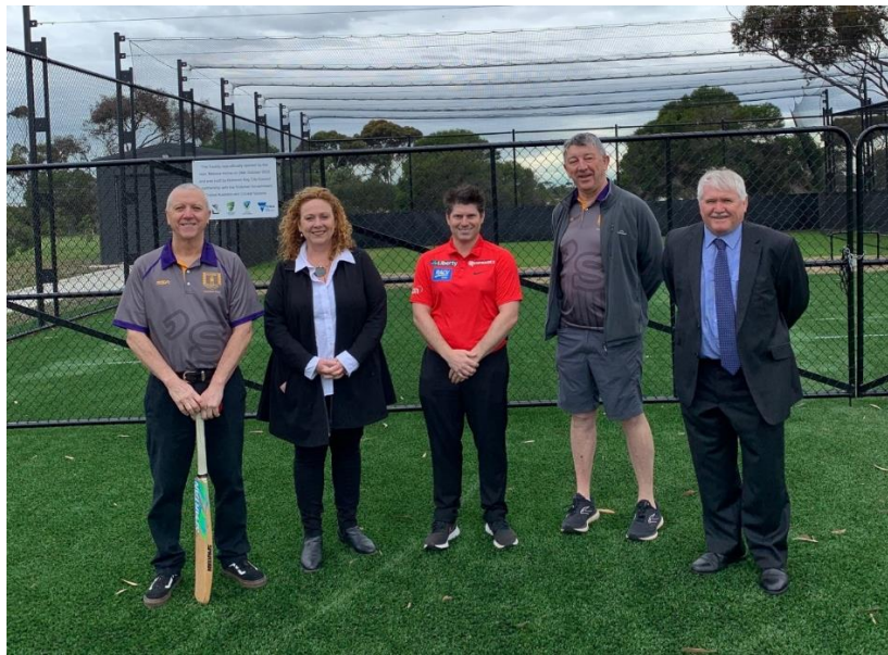
Figure 8: Cr Peter Hemphill with representatives of the Altona Cricket Club and the Member for Williamstown, the Hon Melissa Horne MP

A new cricket practice facility was opened at JK Grant Reserve in October 2022, which will be utilised by the Altona Cricket Club. The facility features six synthetic wickets that complement the existing four wicket turf nets, and retractable netting to create flexible and multi-use spaces. The facility was delivered in partnership with the Victorian Government and Cricket Australia, which contributed $90,000 and $30,000 respectively to support Council's investment in the project of $454,000.