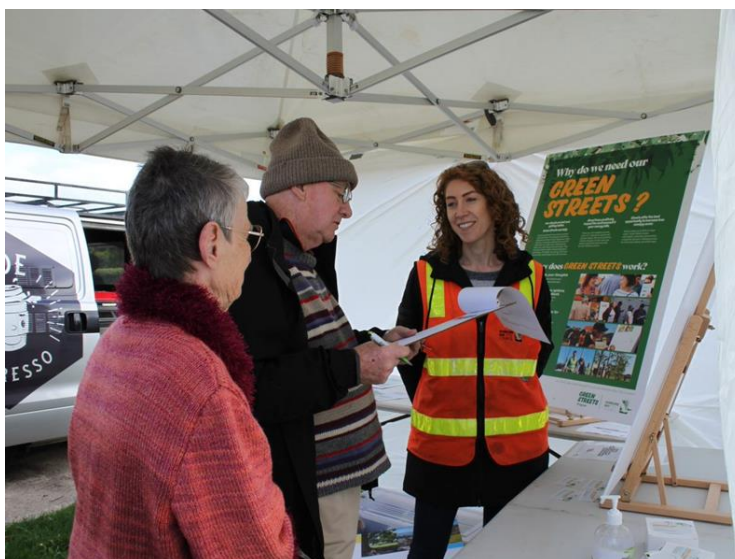
Figure 5: Residents meeting with Council's Urban Forest Engagement Officer at a Green Streets engagement session