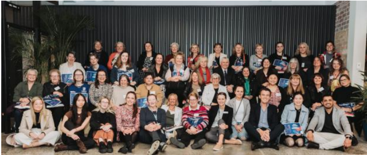
Figure 13: Graduates of the 2022 Daughters of the West Program for Hobsons Bay

Daughters of the West, an initiative of the Western Bulldogs Community Foundation, is a free health program for all women aged 18 or over living, working and recreating in Victoria's West. The 10-week program aims to improve women's health and wellbeing through a series of workshops, presentations and healthy activities. Hobsons Bay City Council is a proud partner in delivering the Daughters of the West program.