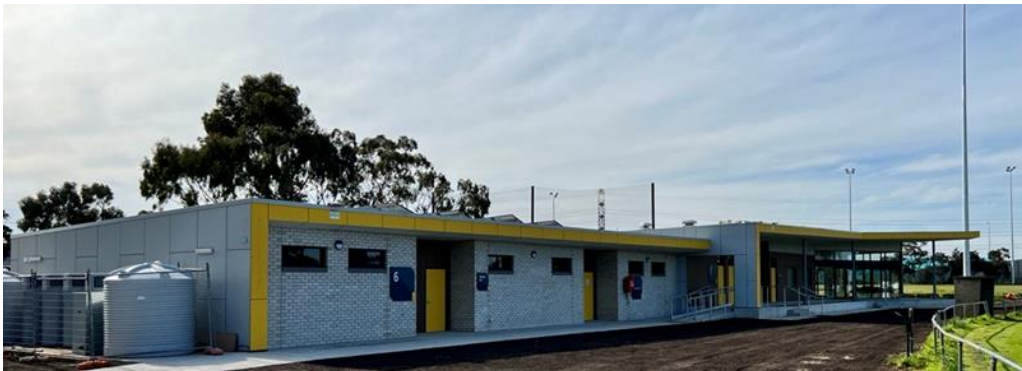
Figure 1: New WLJ Crofts Reserve Pavilion

Funded works in the package are now close to completion with the new sporting pavilion at WLJ Crofts Reserve (Figure 1) and the W&M Couch Pavilion at Donald McLean Reserve now complete and open for use by the sporting clubs. The final landscaping and open space improvement works at these two reserves will be completed in coming months.