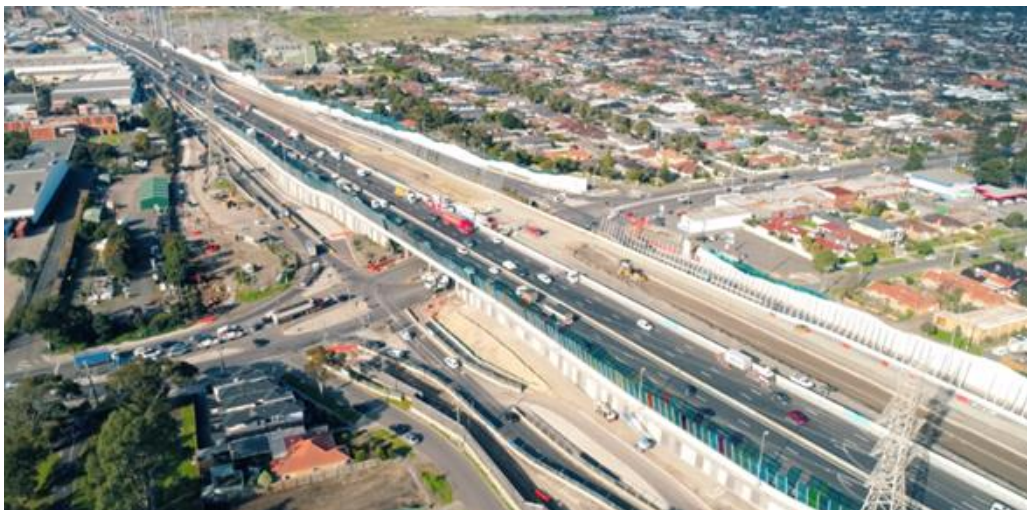
Figure 2: Works at Millers Road

From 19 August to 24 October 2022, the WGTP is carrying out major road works at the Millers Road/West Gate Freeway interchange. At the end of this construction period nearly all the works at Millers Road will be completed. To enable work to be completed as quickly as possible, construction activities are taking place 24/7 and require road, ramp and lane closures with several signed, recommended detour routes in place. Businesses along Millers Road will remain open with access available as normal.