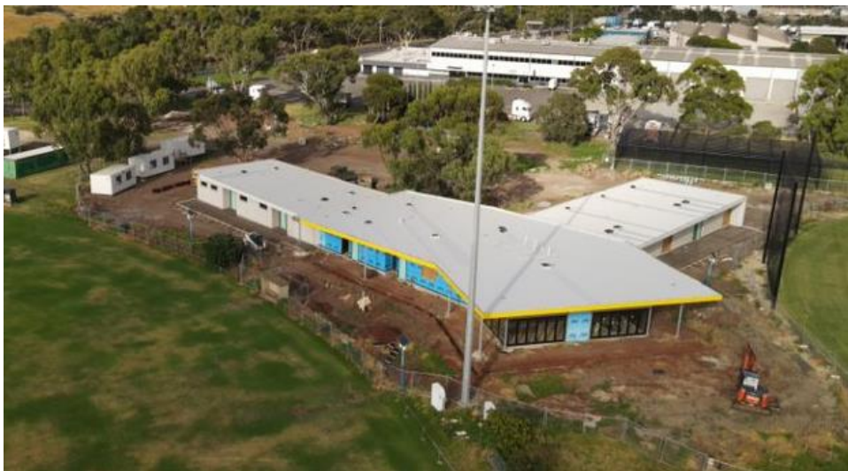
Figure 1: WLJ Crofts Reserve pavilion under construction

Most of the package has been completed and works are progressing on the sporting pavilion at WLJ Crofts Reserve, Altona North (Figure 1) and the Couch Pavilion at Donald McLean Reserve, Spotswood (Figure 2) with completion of both expected in mid-2022. Construction of the open space improvements and replacement playground at Donald McLean Reserve is soon to commence for completion in 2022.