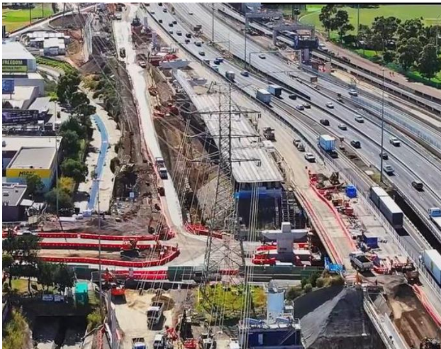
Figure 3: Hyde Street exit ramp at Melbourne Road

Major work continues at the Williamstown Road (Figure 3), Millers Road and the M80/Western Ring Road freeway interchange areas, the Hyde Street ramps and widening the Newport freight rail bridge. Noise wall works continue along both sides of the freeway corridor.