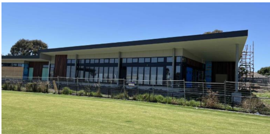
Figure 2: Couch Pavilion under construction at Donald McLean Reserve