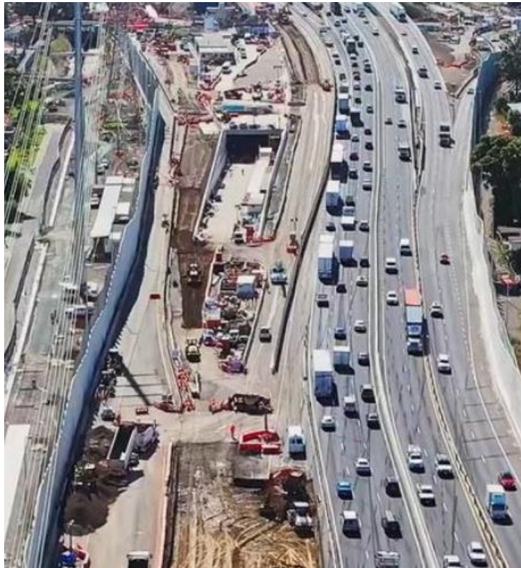
Figure 4: Traffic switch around inbound tunnel portal works

Several traffic lane switches have occurred over the summer construction blitz to enable rebuilding of the freeway in various sections (Figure 4).