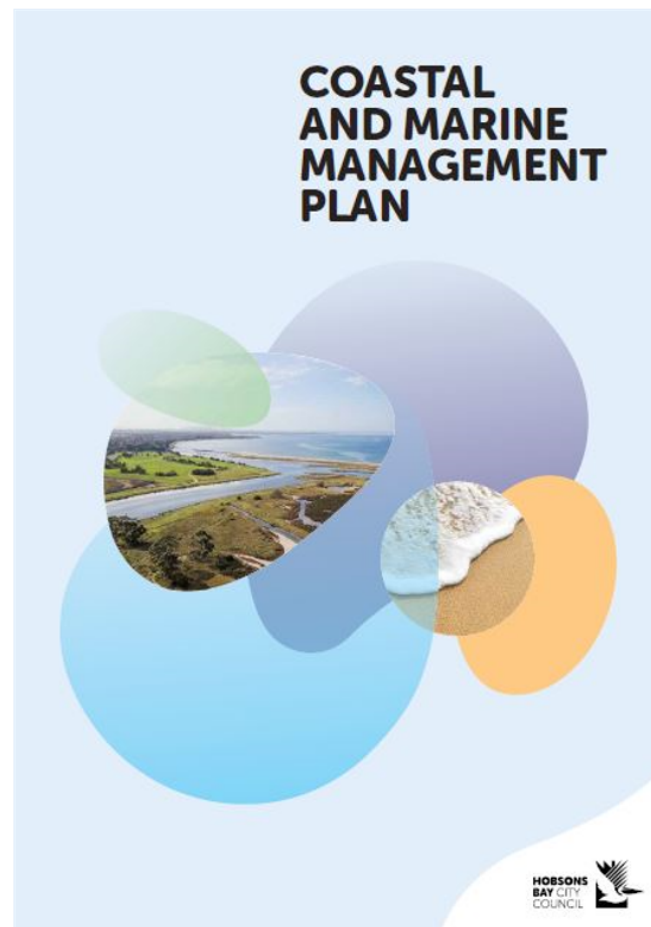
Figure 6: Coastal and Marine Management Plan

Other exciting activities taking place along the coastal areas include: