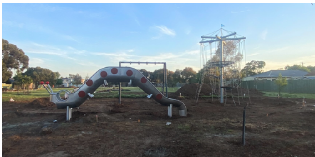
Figure 10: Playground equipment installed at Whittaker Avenue Reserve, Laverton

Implementation of place projects identified in the Better Places Laverton Place Guide is continuing, with a minor playground installation at Whittaker Avenue Reserve recently completed and works at Frank Gibson Reserve progressing well with key pieces of playground equipment and the basketball activity court installed (Figures 10 and 11 respectively). Open space and playground upgrade works at Dick Murdoch Reserve, Henderson Reserve and Croyley Reserve are all planned for completion by June 2022.