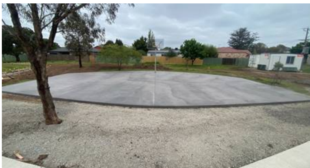
Figure 11: Basketball activity court installed at Whittaker Avenue Reserve, Laverton