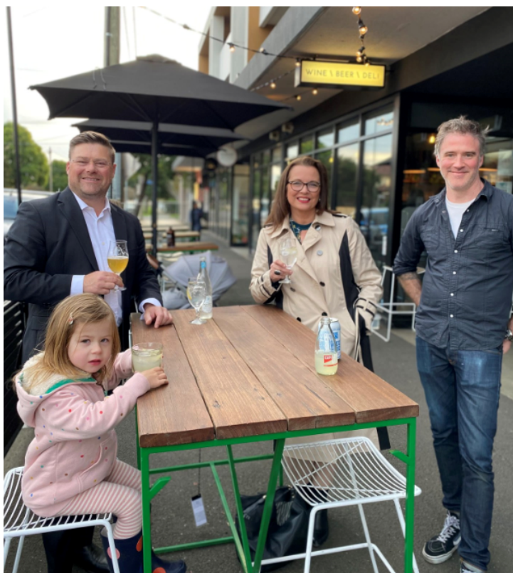
Figure 3: Enjoying the outdoor dining on offer at Brooklyn

The end of lockdown in late October has enabled businesses to make renewed use of their HBBHH Outdoors trading areas. As the Victorian Government announced the winding back of restrictions as immunisation targets were met, Council acted immediately to support businesses to reopen. Within a day of the announcement of further government funding to support outdoor trading, Council formed a rapid response working group to review and, wherever possible, quickly action requests from businesses to establish or re-establish an outdoor trading area. As lockdown ended Council also quickly reinstated infrastructure that had been temporarily removed during lockdown, to enable businesses to resume trading to the fullest allowable extent (Figures 3 and 4).