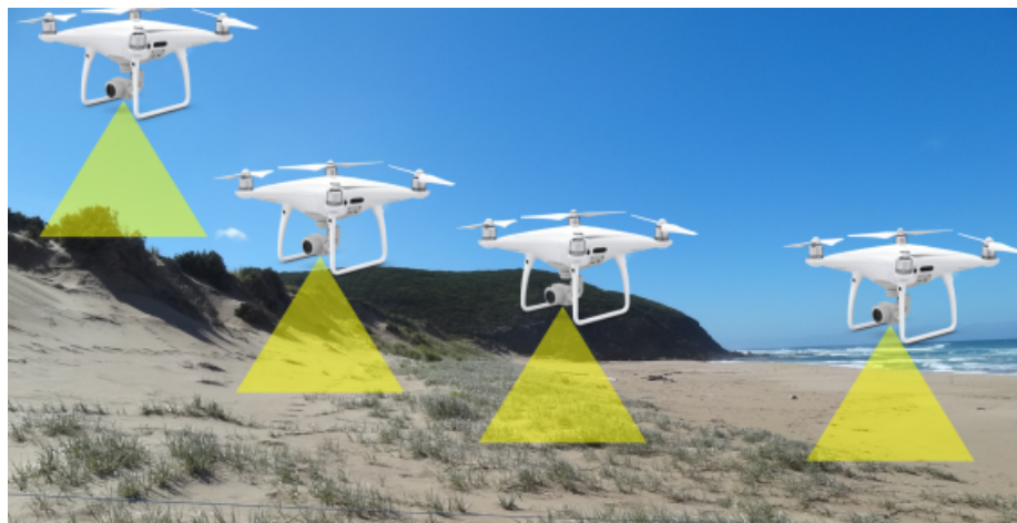
Figure 7: Citizen Science Drone Program