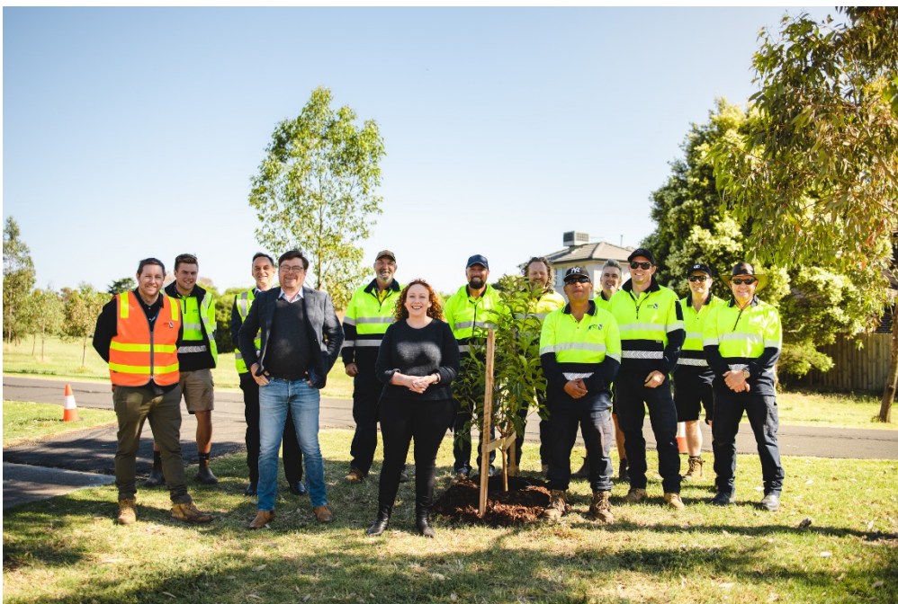
Figure 8: Tree planting with the Honourable Melissa Horne MP and Council officers

An interactive tree planting map using live data will be launched before the 2022 planting season. The map will enable the community to see the locations and species that are to be planted in the upcoming planting seasons and track the progress of the plantings. The community will also be able to access fact sheet data for all plant species.