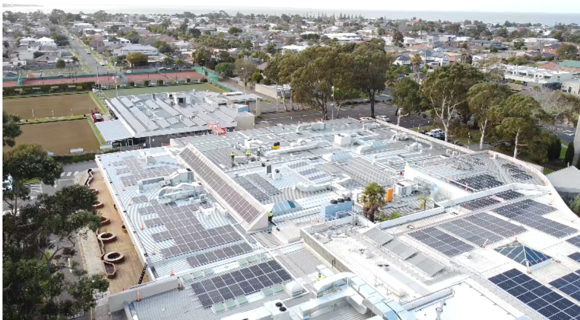
Figure 1: Hobsons Bay Civic Centre completed solar installation

Council has also continued working with the Community Solar Reference Group to explore options for the community to access low-cost renewable energy and reduce their own greenhouse gas emissions. The Community Solar Reference Group met on 14 October 2021 to review options to increase the community's access to renewable energy and reduce emissions. Further work is now being undertaken to ensure that a community program will meet the needs of Hobsons Bay's homeowners, tenants, businesses and not-for-profit organisations.