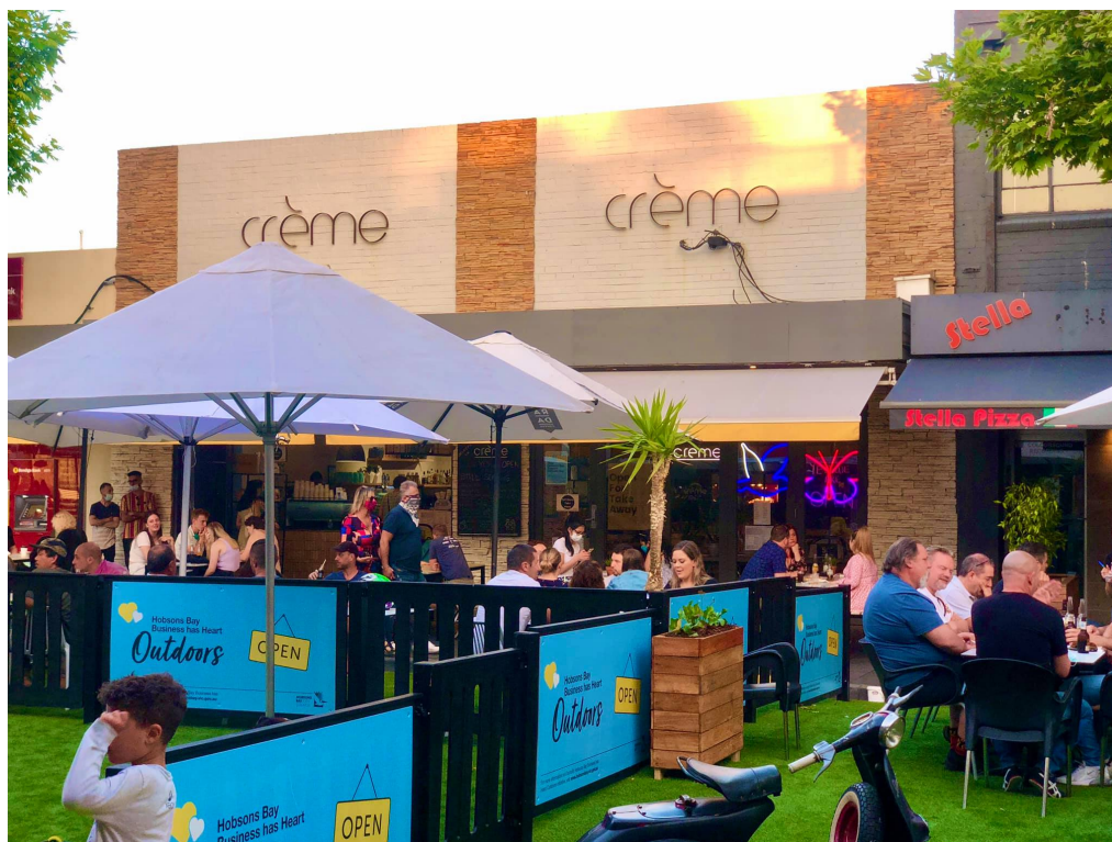
Figure 4: Outdoor Dining at Pier Street, Altona