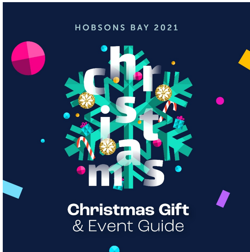
Figure 5: 2021 Christmas Gift and Event Guide