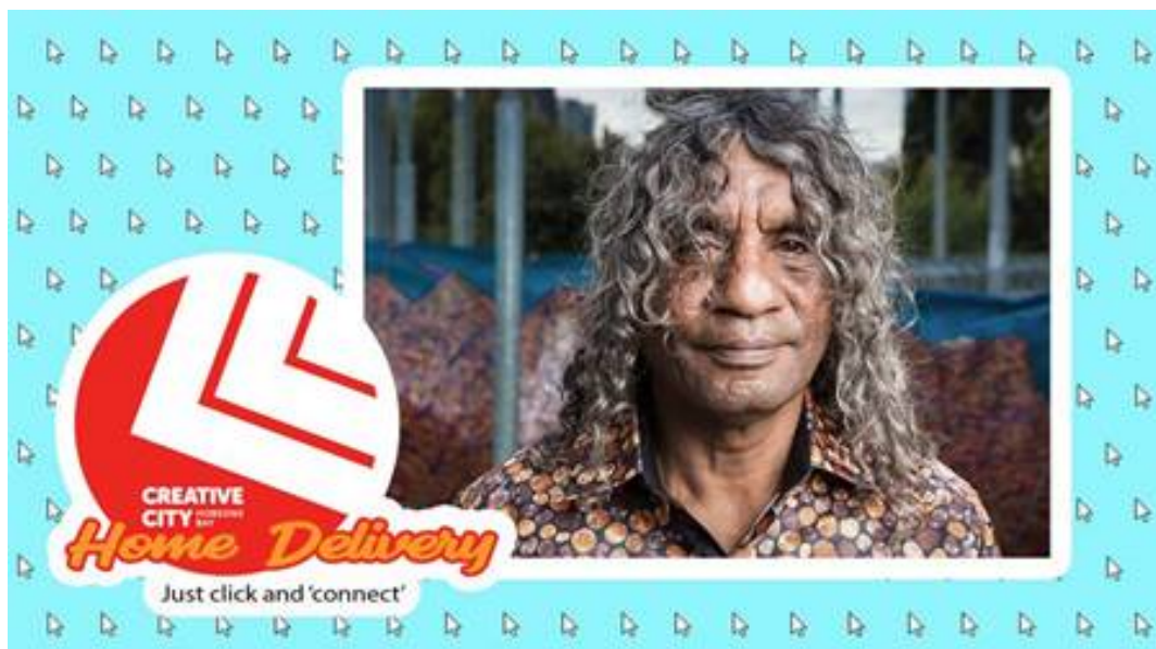
Figure 2: Creative City Home Delivery Session - Bart Willoughby

Bart formed Australia's first Indigenous rock band, the legendary No Fixed Address, in 1978. Known across the music industry as a compelling songwriter, musician and performer, Bart has broken down barriers and paved the way in Australian roots music for the many Indigenous artists who have followed.