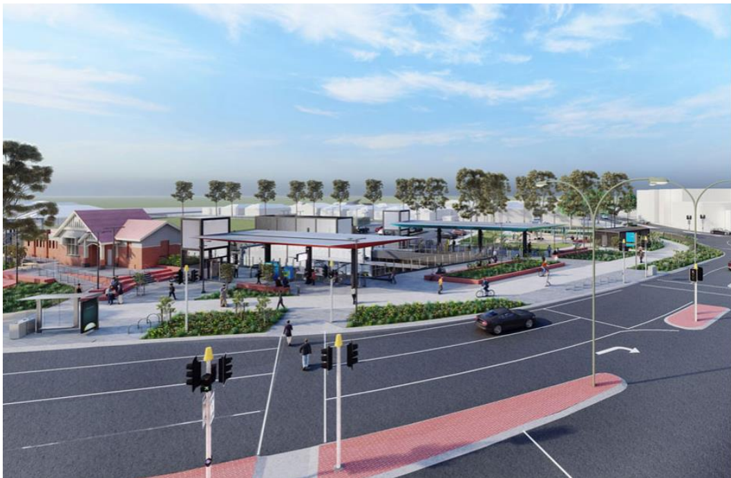
Figure 1: Artist's impression of west side of new station forecourt entry (subject to change)

The west station house will be retained and will continue to be a focal point within the precinct, preserving the character of the area. Together with the landscape, amenity improvements and public art this will enhance the area and continue to “tell the story” of the local community.