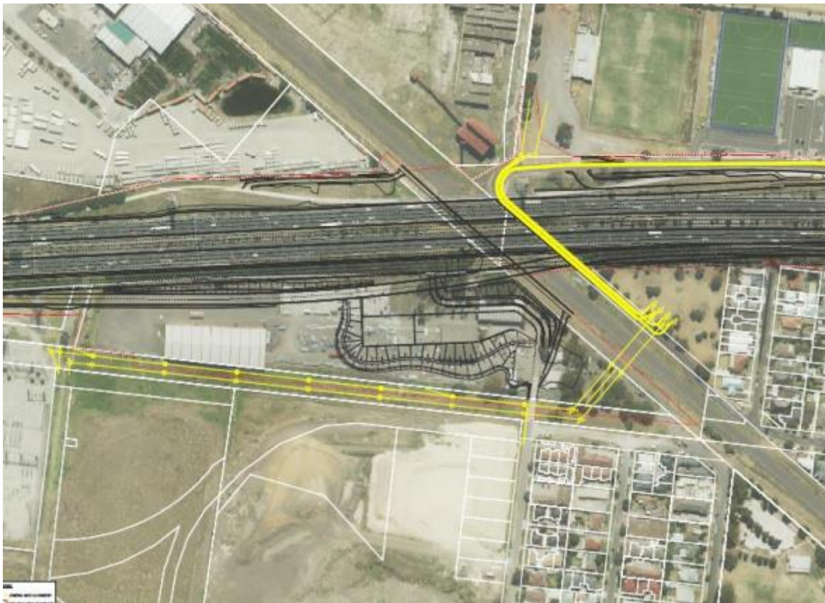
Figure 4: Alignment of powerlines around the southern tunnel portal

Approve the proposed temporary overhead relocated 66KV power lines within the SP Ausnet easement between the Newport rail line and the Brooklyn Terminal Station in the submitted design on the condition that it is placed underground by the JV prior to September 2022.