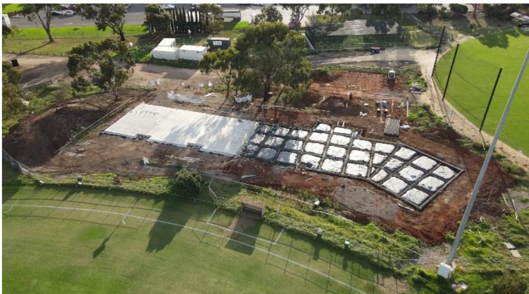
Figure 2: Concrete floor slab installation to sporting pavilion at WLJ Crofts Reserve

The new multipurpose courts at Donald McLean Reserve are now in operation and can be booked for casual use via the online Book A Court system: