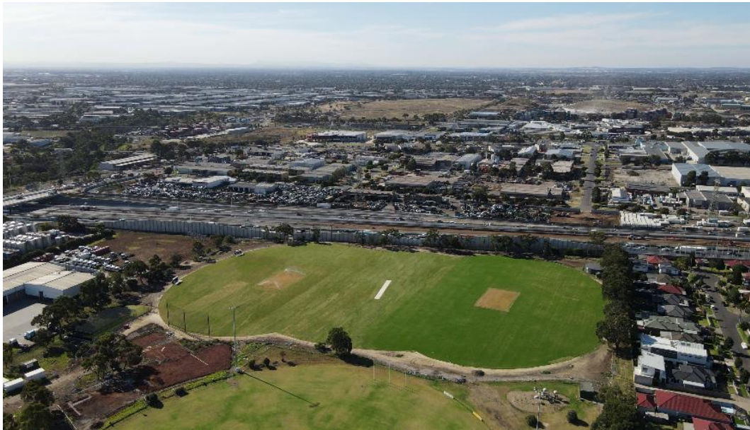
Figure 1: Northern playing fields at WLJ Crofts Reserve

The new cricket practice nets at WLJ Crofts Reserve are complete and the northern sportsgrounds have been established, spanning 2.9 hectares and including two formal irrigated ovals with turf wickets and a synthetic wicket between the ovals (Figure 1). This feature allows for multiple uses on the ovals with shorter change-around times for teams. Works on the sporting pavilion are also well underway with concrete slabs currently being installed (Figure 2).