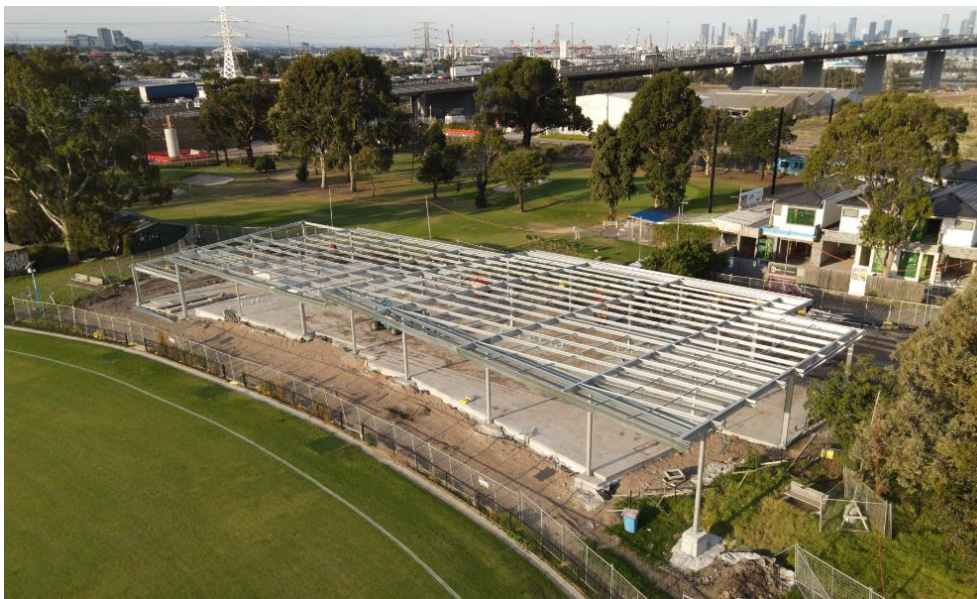
Figure 3: WH Couch Pavilion under construction

The steel framework has been erected for the new WH Couch Pavilion at Donald McLean Reserve (Figure 3) with the roof to be installed over the coming weeks.