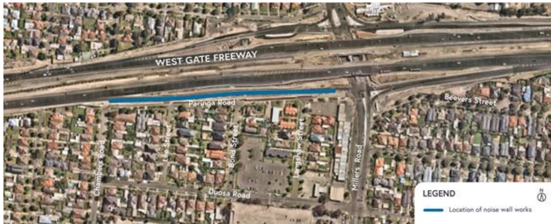
Figure 8: Placement of noise walls at the Millers Road outbound on-ramp