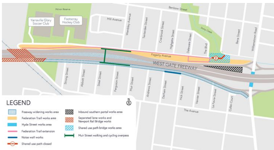
Figure 6: Current works between Newport Rail Bridge and Williamstown Road

Figure 6 below is a summary of construction activities proposed in the area from April to June 2021.