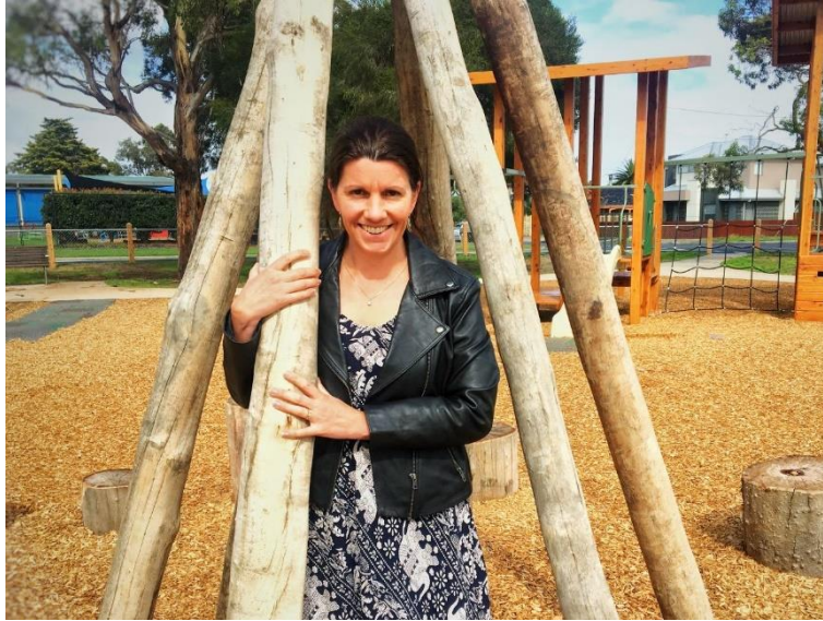
Figure 1: Mayor Cr Colleen Gates at G Den Dulk Reserve, Altona