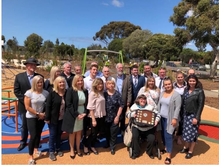
Figure 5: Curlew Community Park

Curlew Community Park has quickly become a valued asset by the community, with positive feedback received and an increasing number of visitors. It provides much-needed green open space, infrastructure and activities for people of all ages and abilities, including families with young children, the elderly and the often-neglected youth age group.