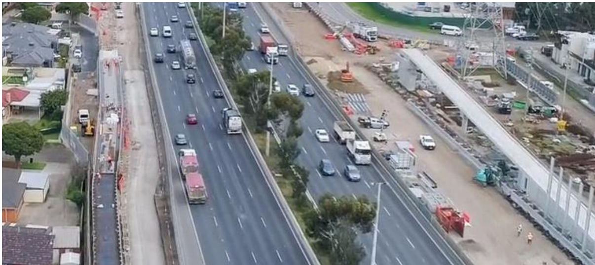
Figure 1: Rosala Avenue pedestrian overpass construction

To assist continued connection for the community the JV constructed a new footpath on The Avenue under the Newport Rail Bridge and implemented a courtesy bus service for Yarrville/Spotswood and Altona North/Brooklyn communities. A review of the service has included a survey of residents, community groups, local schools and sporting clubs to determine improvements to best meet the local access needs. No reduction in bus services will be made without the written agreement of Council and WGTP MTIA.