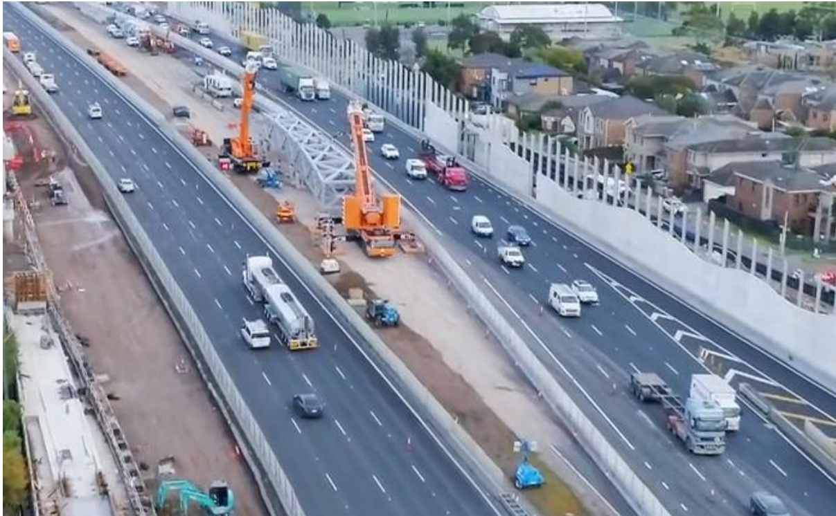
Figure 2: Muir Street pedestrian overpass construction