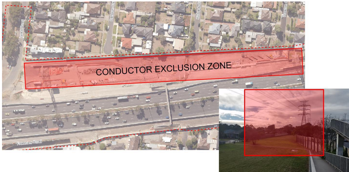
Figure 2: 220KV Powerline Construction Site

Pedestrian access detours have been established via adjacent local roads and Millers Road. Council raised concerns on behalf of the immediate community pertaining to the lack of notification and alternative transport options provided during the immediate works period. Council continues to engage with the JV to determine preferred transport support options for local residents while the Rosala Avenue overpass is closed.