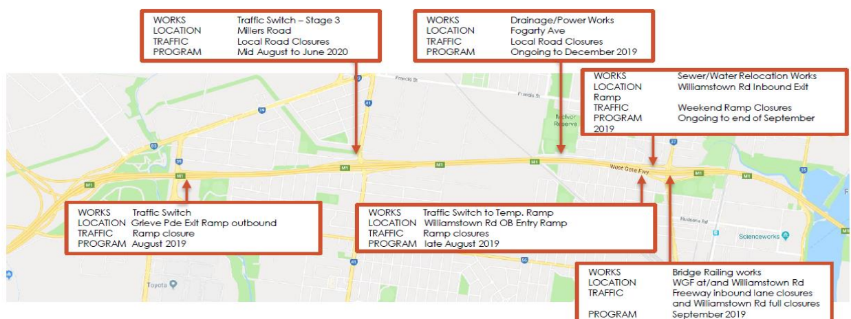
Figure 3: Current Traffic Impacts

Some night time and freeway ramp closures have been programmed, with detailed Traffic Management and Communications Plans to be implemented in the lead up to closures. Figures 3 and 4 below highlight the current and upcoming traffic impacts and work locations between Hyde Street and the M80 interchange.