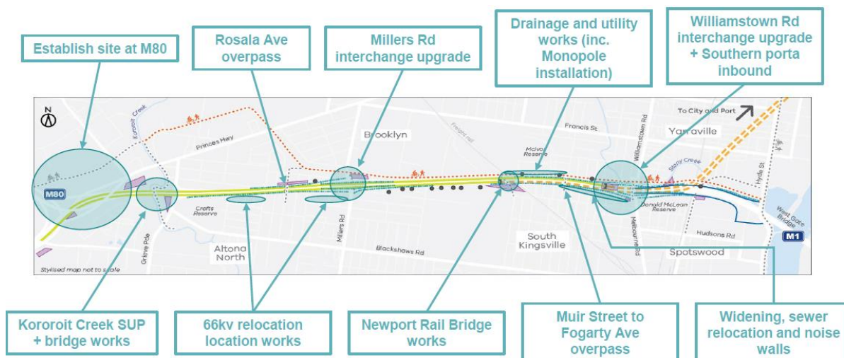
Figure 1: Current Project Construction Activity

Figure 1 below outlines the current Project related activities along the West Gate Freeway section: