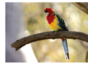
Eastern Rosella Platycercus eximius Size: 29-33cm Habitat: Open Woodland