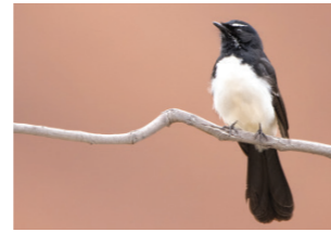
Willie Wagtail Rhipidura leucophrys Size: 19-22cm Habitat: Diverse