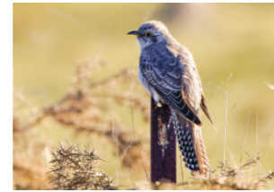
Pallid Cuckoo Cacomantis pallidus Size: 28-34cm Habitat: Open Woodland