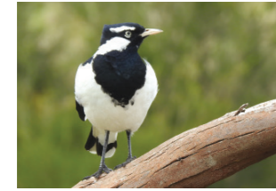
Magpie Lark Grallina cyanoleuca Size: 26-30cm Habitat: Diverse