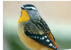
Spotted Pardalote Pardalotus punctatus Size: 8-10cm Habitat: Open Woodland