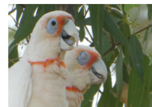
Long Billed Corella Cacatua tenuirostris Size: 38-41cm Habitat: Diverse