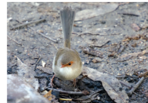
Superb Fairy-wren (F) Malurus cyaneus Size: 13-14cm Habitat: Diverse