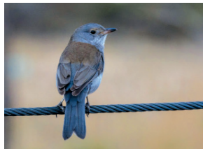
Grey Shrike-thrush Colluricincla harmonica Size: 22-25cm Habitat: Diverse