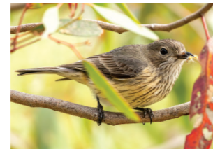
Rufous Whistler (F) Pachycephala rufiventris Size: 16-18cm Habitat: Grassland