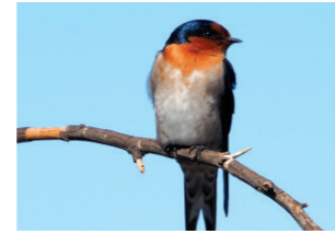
Welcome Swallow Hirundo neoxena Size: 14-15cm Habitat: Diverse