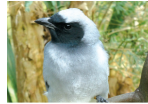
Black-faced Cuckoo-shrike Coracina novaehollandiae Size: 30-36cm Habitat: Open Woodland