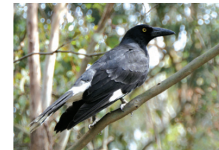
Pied Currawong Strepera graculina Size: 42-50cm Habitat: Diverse