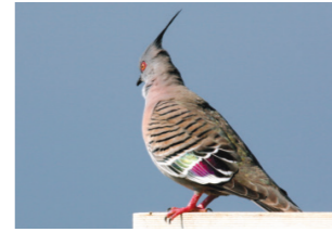
Crested Pigeon Ocyphaps lophotes Size: 31-35cm Habitat: Diverse