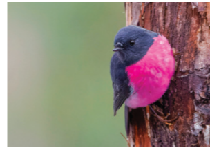
Pink Robin (M) Petroica rodinogaster Size: 11-13cm Habitat: Open Woodland