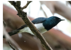
Satin Flycatcher (M) Myiagra cyanoleuca Size: 15-17cm Habitat: Open Woodland