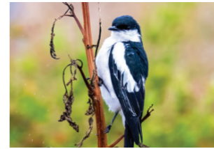
White-winged Triller Lalage tricolor Size: 16-19cm Habitat: Open Woodland