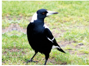
Australian Magpie Cracticus tibicen Size: 37-44cm Habitat: Diverse