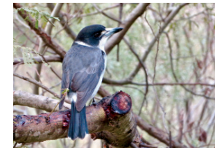
Grey Butcherbird Cracticus torquatus Size: 26-30cm Habitat: Forest