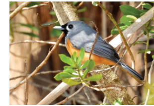
Black-faced Monarch Monarcha melanopsis Size: 16-20cm Habitat: Open Woodland