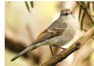
Golden Whistler (F) Pachycephala pectoralis Size: 16-18cm Habitat: Open Woodland