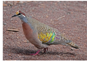
Common Bronzewing Phaps chalcoptera Size: 30-36cm Habitat: Diverse