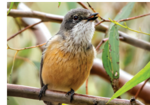
Rufous Whistler (M) Pachycephala rufiventris Size: 16-18cm Habitat: Grassland