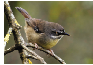
White-browed Scrubwren Sericornis frontalis Size: 11-13cm Habitat: Diverse