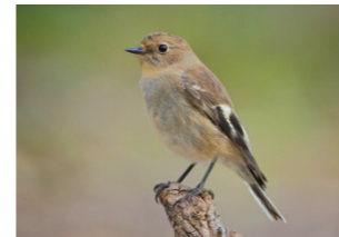
Flame Robin (F) Petroica phoenicea Size: 13-14cm Habitat: Open Woodland