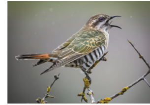
Horsfield's Bronze Cuckoo Chalcites basalis Size: 14-17cm Habitat: Diverse