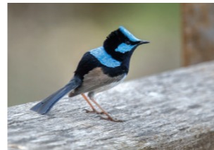
Superb Fairy-wren (M) Malurus cyaneus Size: 13-14cm Habitat: Diverse