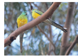
Red-rumped Parrot Psephotus haematonotus Size: 26-28cm Habitat: Open Woodland