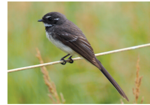
Grey Fantail Rhipidura albiscapa Size: 14-17cm Habitat: Open Woodland