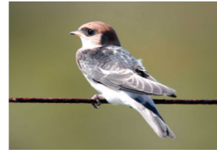
Fairy Martin Petrochelidon ariel Size: 12-13cm Habitat: Open areas