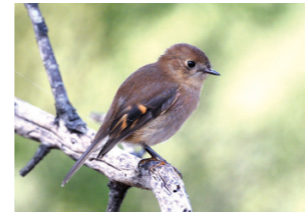
Pink Robin (F) Petroica rodinogaster Size: 11-13cm Habitat: Open Woodland