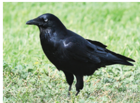
Little Raven Corvus mellori Size: 48-54cm Habitat: Open areas