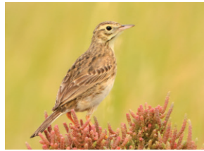
Australasian Pipit Anthus novaeseelandiae Size: 45-55cm Habitat: Grassland