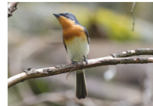
Satin Flycatcher (F) Myiagra cyanoleuca Size: 15-17cm Habitat: Open Woodland