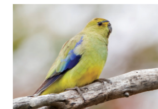
Blue-winged Parrot Neophema chrysostoma Size: 20-22cm Habitat: Saltbush