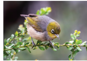
Silvereye Zosterops lateralis Size: 11-13cm Habitat: Diverse