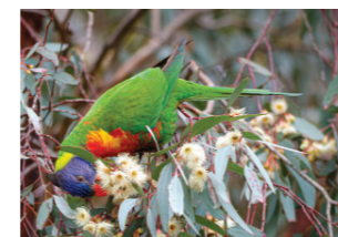
Rainbow Lorikeet Trichoglossus moluccanus Size: 26-31cm Habitat: Diverse