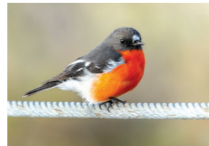
Flame Robin (M) Petroica phoenicea Size: 13-14cm Habitat: Open Woodland