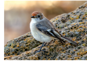
Red-capped Robin (F) Petroica goodenovii Size: 11-12cm Habitat: Open Woodland