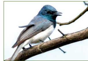
Leaden Flycatcher (M) Myiagra rubecula Size: 15-16cm Habitat: Open Woodland