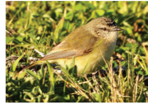
Yellow-rumped Thornbill Acanthiza chrysorrhoa Size: 11-12cm Habitat: Open Woodland