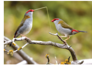
Red-browed Finch Neochmia temporalis Size: 11-12cm Habitat: Scrub