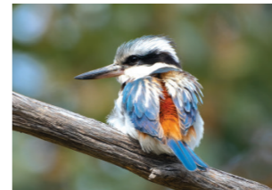
Red-backed Kingfisher Todiramphus pyrrhopygius Size: 20-24cm Habitat: Waterways

We acknowledge the Bunurong People of the Kulin Nation as the Traditional Owners of the lands, rivers and coastal areas in Hobsons Bay. We recognise the First Peoples' relationship to this land and offer our respect to their Elders past and present.