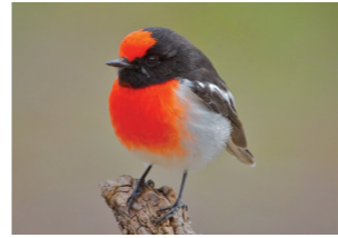
Red-capped Robin (M) Petroica goodenovii Size: 11-12cm Habitat: Open Woodland