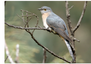
Fan-tailed Cuckoo Cacomantis flabelliformis Size: 25-27cm Habitat: Open Woodland