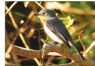
Leaden Flycatcher (F) Myiagra rubecula Size: 15-16cm Habitat: Open Woodland