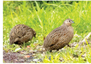
Brown Quail Coturnix ypsiphora Size: 17-20cm Habitat: Diverse