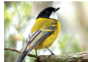
Golden Whistler (M) Pachycephala pectoralis Size: 16-18cm Habitat: Open Woodland