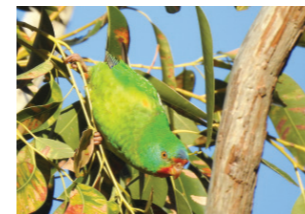
Swift Parrot Lathamus discolor Size: 23-26cm Habitat: Open Woodland