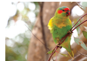
Musk Lorikeet Glossopsitta concinna Size: 21-23cm Habitat: Open Woodland