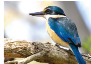
Sacred Kingfisher Todiramphus sanctus Size: 20-23cm Habitat: Waterways