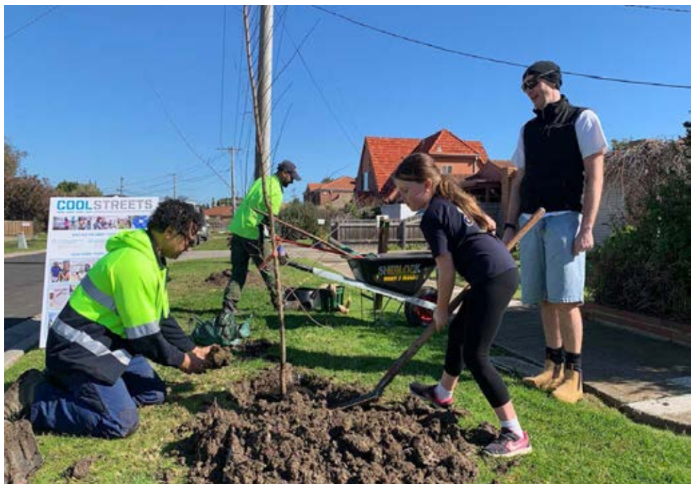
Cool Streets® event Hobsons Bay in 2019

A diverse range of tree species can help to minimise tree loss. While there are more than 550 different tree species in the city, 50 per cent of Hobsons Bay's trees are in the Myrtaceae family. This dominance of a single family or genus can leave the overall tree population at risk of mass decline if a pest or disease is introduced. Future tree plantings should also incorporate a wider range of taller species with generous canopies to help combat urban heat.