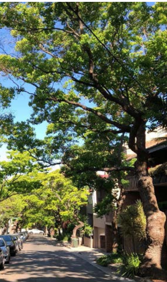
Tree canopy in dense urban setting

The urban forest refers to all trees on public and private land within urban areas. The urban forest is comprised of tree groves, avenues or individual specimens, located in a range of environments from public parks, squares, street verges, main streets to rail corridors, creek embankments, schools, campuses, business parks and private gardens. The urban forest can also include all types of trees including exotics, natives, deciduous and evergreens of varying sizes.