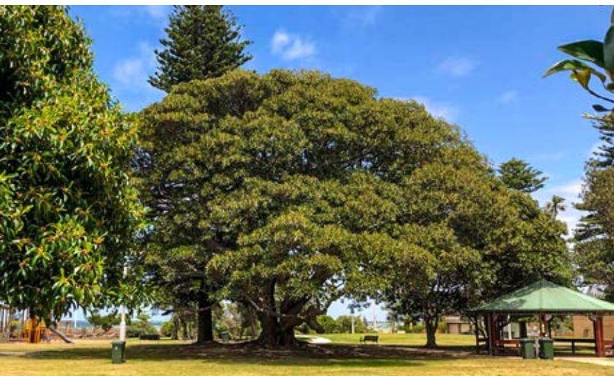
Logan Reserve in Altona, the Moreton Bay Fig ( Ficus macrophylla ), likely planted in 1917 is a landmark specimen, 2019.

Trees were seen as fundamental elements in the early design of the city. Extensive planting of street trees probably began in the 1880's in Williamstown and were integrated into the streetscape design. They were often given elaborate guards of timber or iron. According to newspapers from 1884, trees were "one of the most noticeable features in the place".