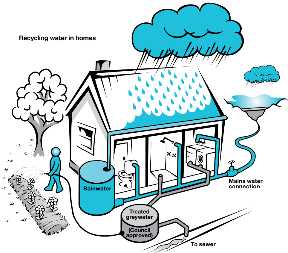
Recycling water in homes

Prior to planning a greywater treatment system, you need to obtain advice from a licensed plumber, the Department of Health and the Environment Protection Authority. A permit from Council is required.