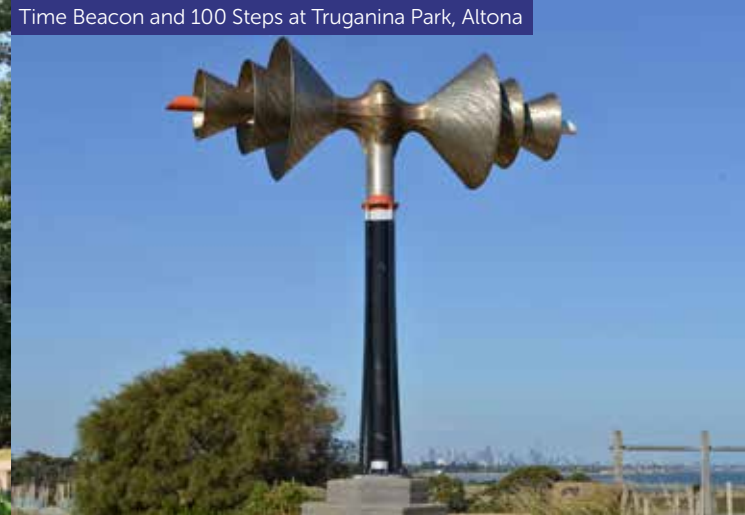
Time Beacon and 100 Steps at Truganina Park, Altona