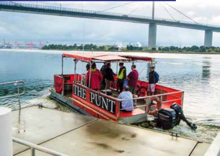
Bicycle and pedestrian Punt over the Yarra River, Spotswood