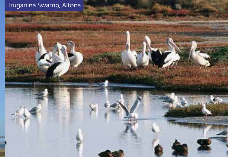
Truganina Swamp, Altona