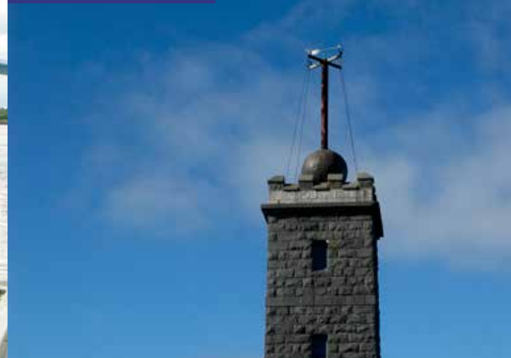
Timeball Tower, Williamstown