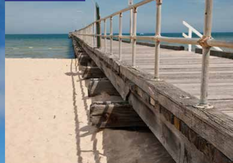
Altona Beach Pier, Altona