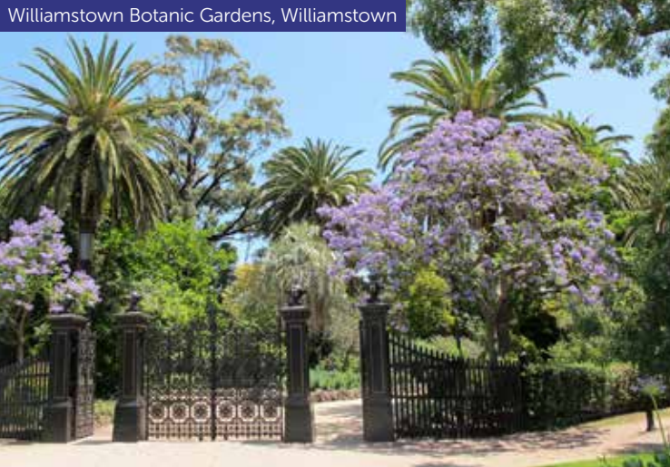
Williamstown Botanic Gardens, Williamstown