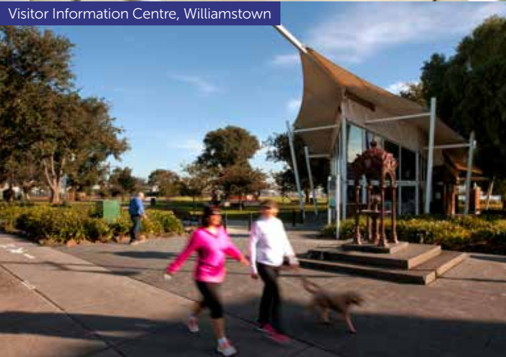
Visitor Information Centre, Williamstown