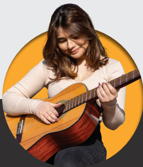
ART & MUSIC