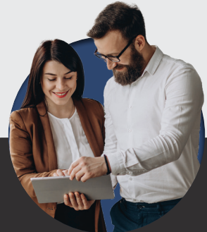
BUSINESS & INNOVATION