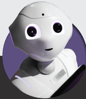
SCIENCE, TECHNOLOGY, ENGINEERING, ARTS AND MATHEMATICS (STEAM)