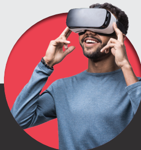
VIDEOGAMES & BOARDGAMES