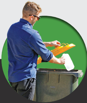
ENVIRONMENT & SUSTAINABILITY