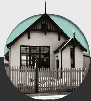
HERITAGE, WRITING & PUBLISHING