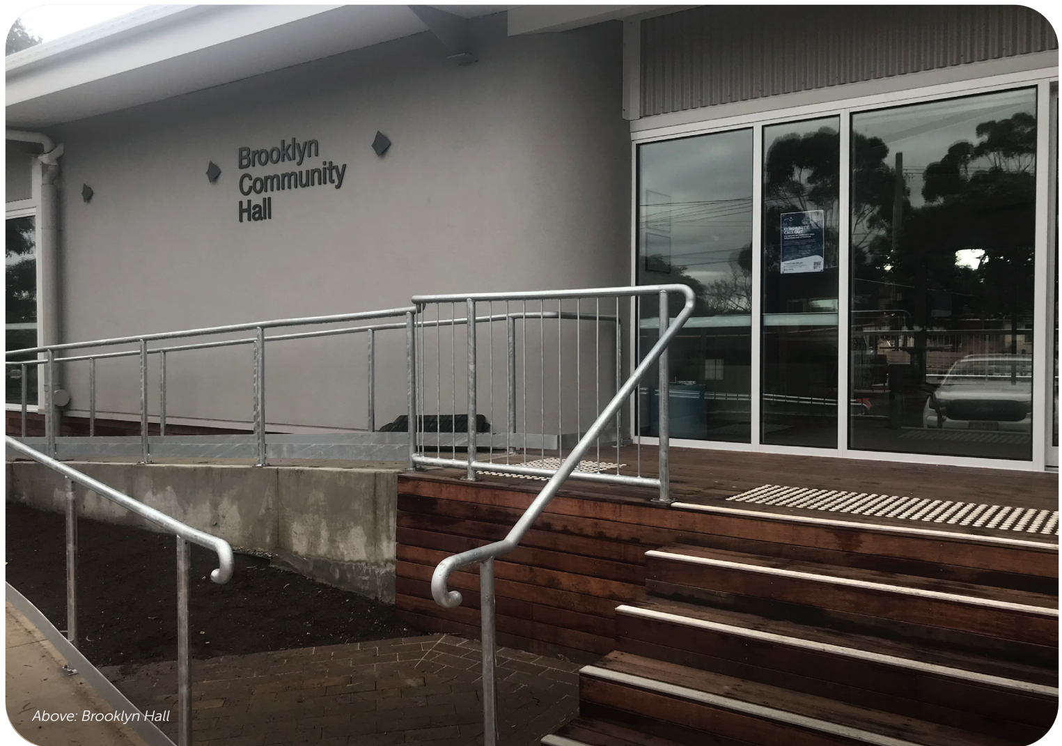
Above: Brooklyn Hall