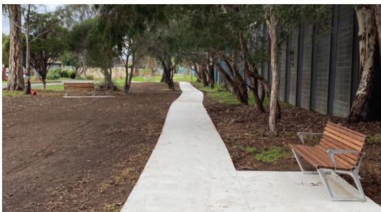
Above: Alma Avenue

The upgrade of four smaller parks in Laverton has been completed. Jamison Street, Tyquin Street, Alma Avenue have all received new concrete footpaths, seating, landscaping, and fencing.