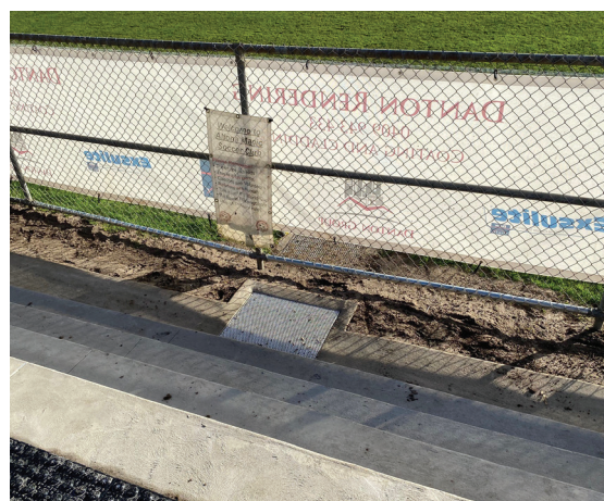
Above: Paisley Park, Altona North - Soccer Complex Spectator Improvements