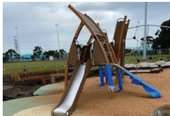
Above: Croft Reserve Open Space and Playground