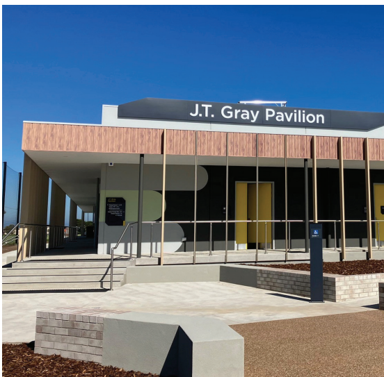
Above: Brooklyn Hall Redevelopment

Completion of the last piece on JT Gray reserve. The completed project includes a new pavilion, carparking, cricket nets and behind goal netting . The project was delivered in a challenging environment, in consideration to its location near the refinery, situation within a flood plane and construction through COVID. The building itself stands out on Koroit Creek Road and has a massive usage on weekends through multiple clubs.