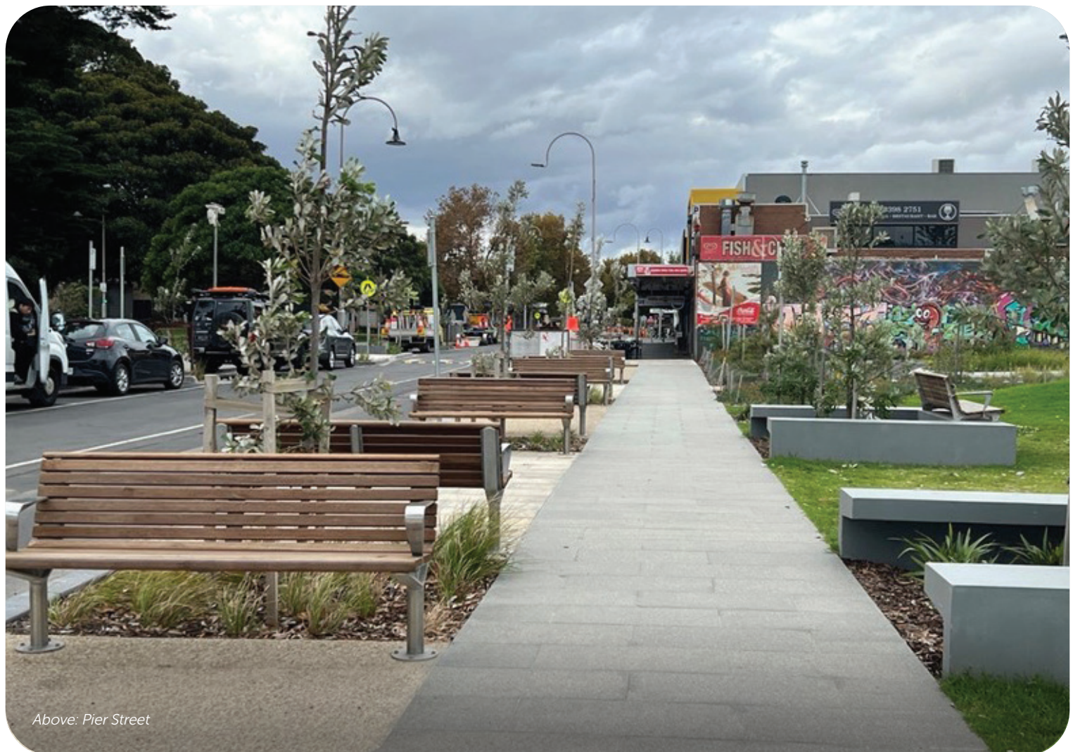
Above: Pier Street