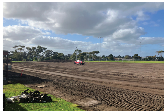
Above: Above: Kim Reserve Sports Field, Altona