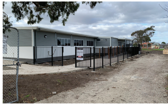
Above: Sutton Avenue Kindergarten modular building installation