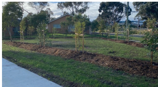
Above: Williams Street