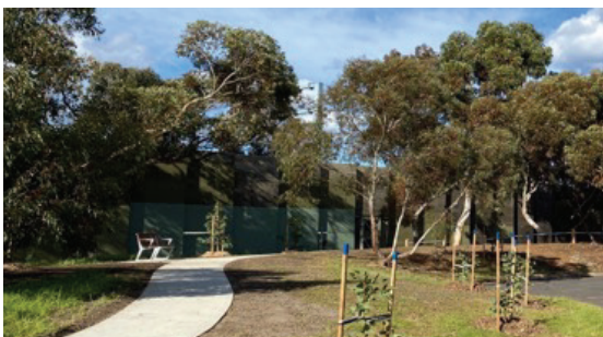
Above: Tyquin Street