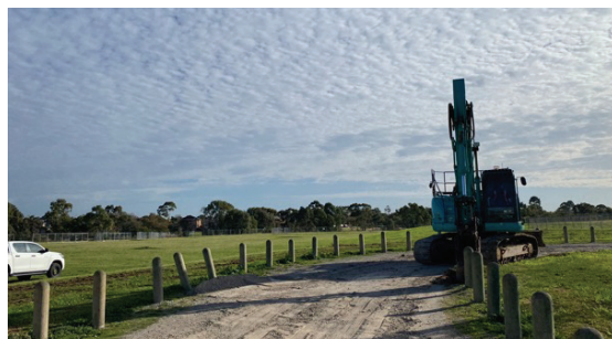
Above: Bruce Comben Open Space Development (southern area)