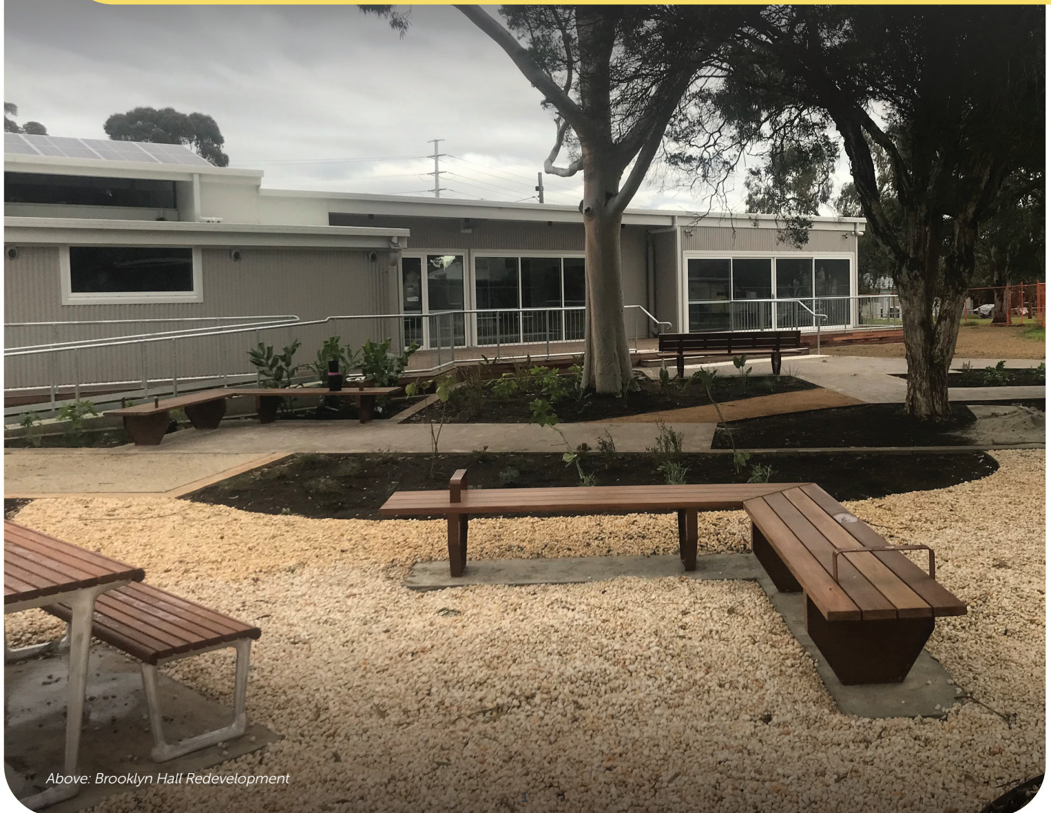
Above: Brooklyn Hall Redevelopment