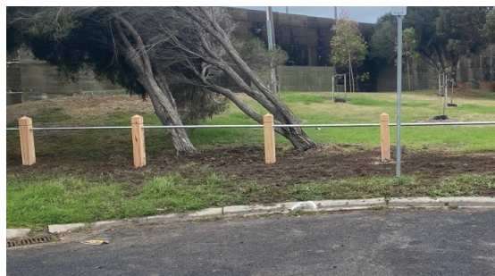
Above: Jamison Street