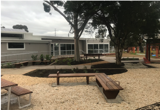
Above: Brooklyn Hall Redevelopment

The redevelopment of Brooklyn Hall has been completed, providing a new community kitchen, new meeting rooms, and community spaces, along with a refresh of the old community hall. While the external reserve landscaping works are still underway, they will complement the use of the hall.