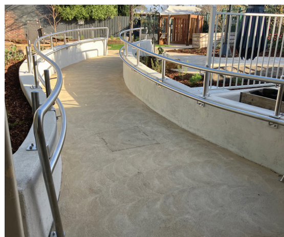
Above: Robina Scott Kindergarten external works