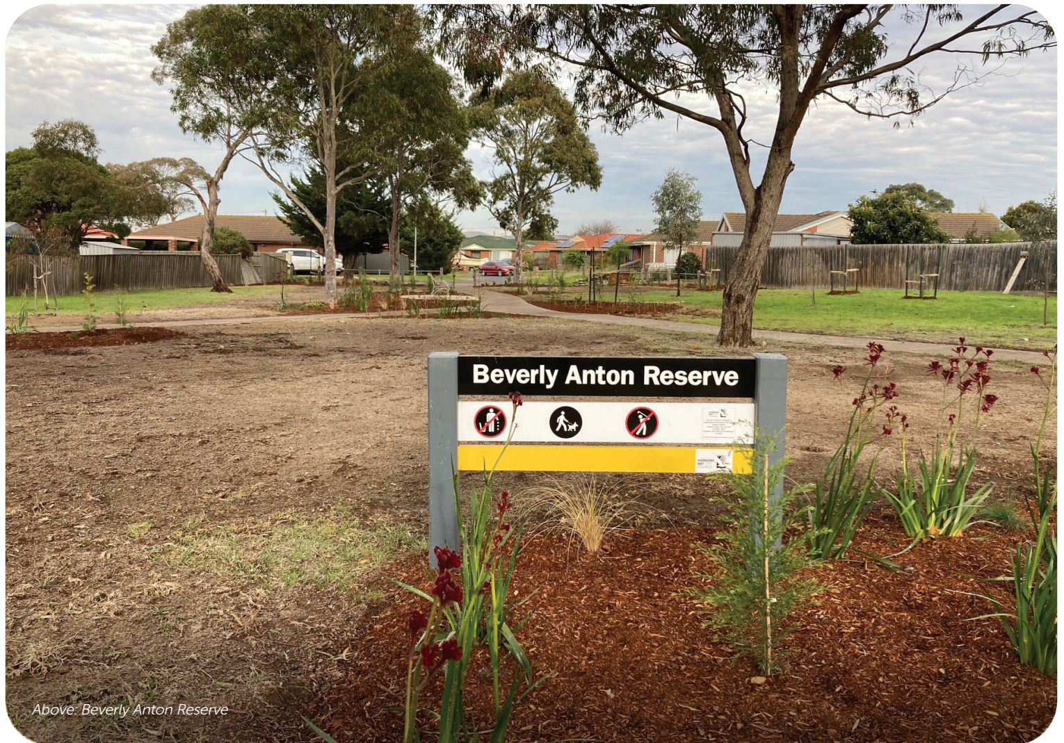
Above: Beverly Anton Reserve