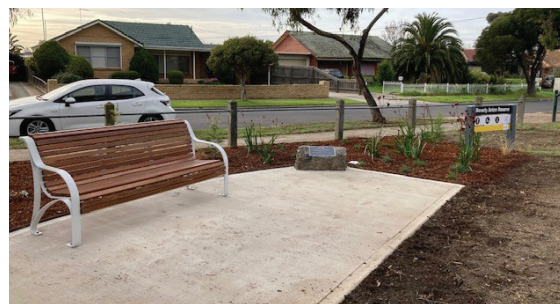
Above: Beverly Anton Reserve