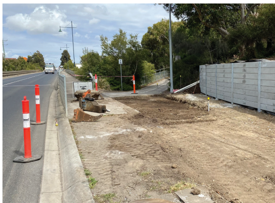
Above: Barnes Road Shared User Path.

A new 2-metre-wide concrete shared user path is being constructed along Barnes Road to provide users safe access between the Kororoit Creek trail and Champion Road in Altona North. The path will also include a pedestrian refuge in both Chambers Road and Barnes Road to allow pedestrians to cross the road safely. Works are expected to be completed by by early 2023.