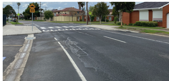
Above: Altona Green Primary School Road Safety Works