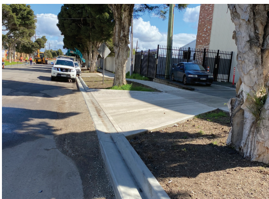
Above: Paw Paw Road Rehabilitation works.

Road rehabilitation works in Paw Paw Road have been completed between Old Geelong Road and Burgess Street in Brooklyn. Works included the reconstruction of kerb and channel on both sides of the road, additional drainage at the intersection of Pearl St, construction of new footpath on the north side of Paw Paw Rd and resurfacing of the existing road pavement.