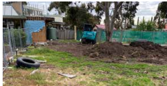
Above: Altona North Children's Centre Expansion (One Tree) & North Building Renewal