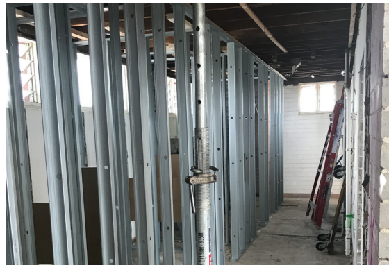
Above: Brooklyn Hall Redevelopment