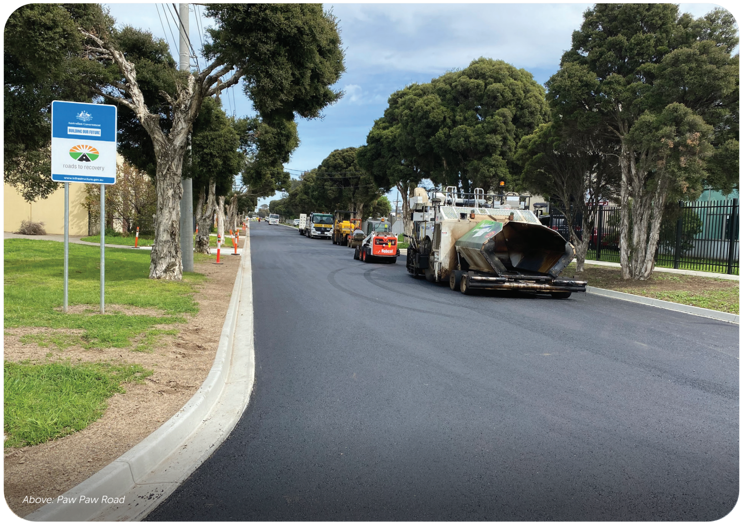
Above: Paw Paw Road