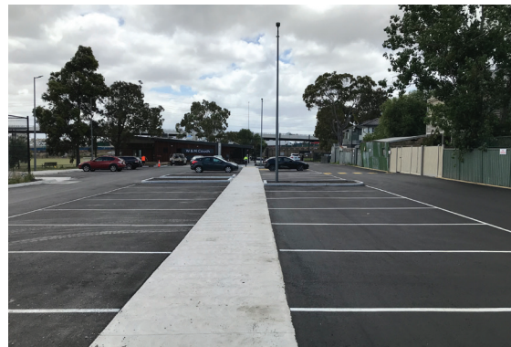
Above: Donald McLean Reserve and Pavilion